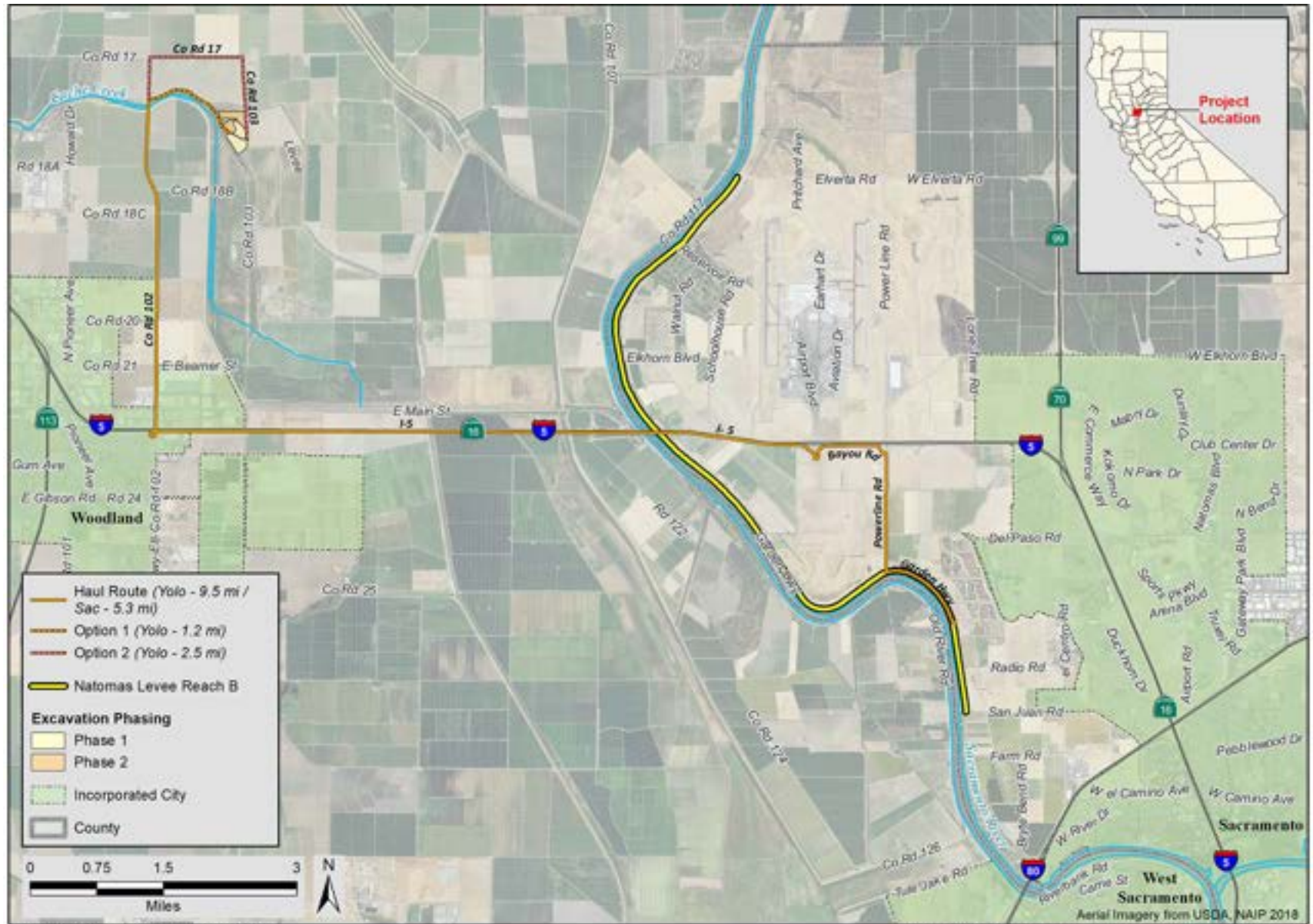
Figure 4-2. Cache Creek Settling Basin Excavation Site Haul Route