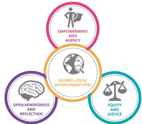
Figure 1: Sustainability Mindsets