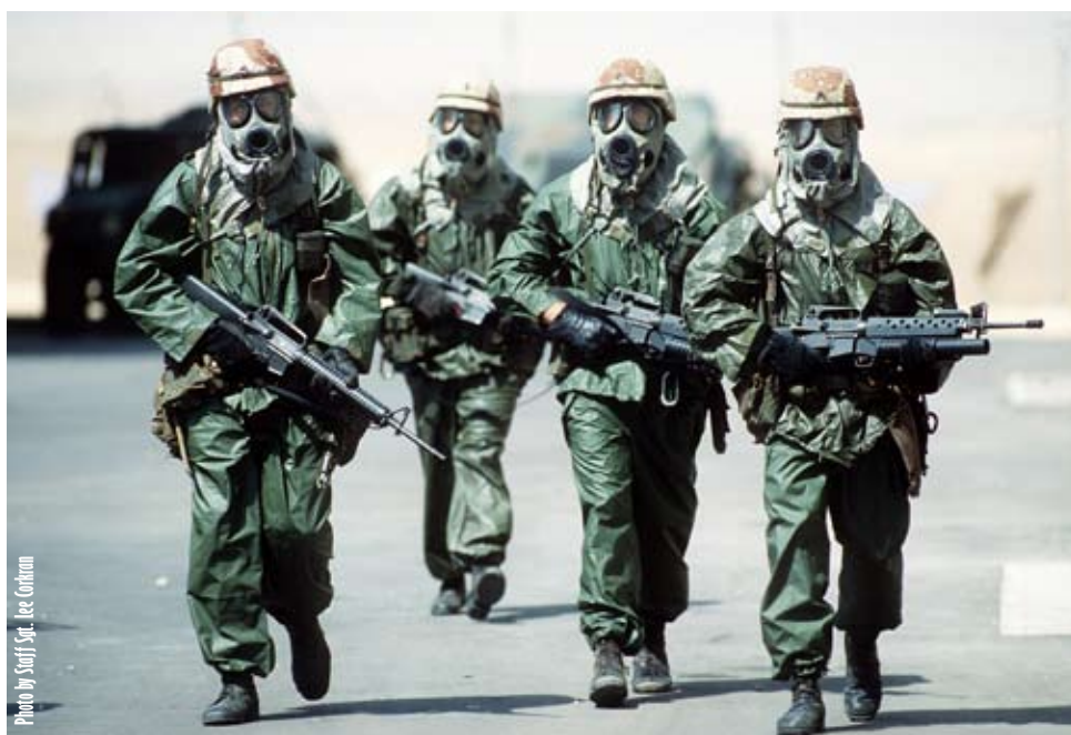
Gulf gear —Wearing gas masks and protective gear, soldiers from the 82nd Airborne Division acclimate to the Saudi heat during Operation Desert Shield in 1990.

VA researchers looked at changes in health between 1995 to 2005 among Veterans who had been deployed to the Persian Gulf for operations Desert Storm and Desert Shield, and those who had served during the same era but had not been deployed to the Gulf. The 2005 follow-up study included 5,469 deployed and 3,353 non-deployed Veterans who had also taken part in the 1995 baseline study. The 2005 data, based on mailed surveys and phone interviews, showed that deployed Veterans were more likely to report poor health in terms of limitations on daily activities, repeat clinic visits and hospitalizations, chronic fatigue symptoms, posttraumatic stress disorder, and self-perceived health status. According to the study authors, during the 10-year period, "The health of deployed Veterans worsened in comparison with nondeployed Veterans because of a higher rate of new onset of various health outcomes and greater persistence of previously reported adverse health on the indices." For complete information on VA's Gulf War research and care, visit www.publichealth.va.gov/exposures/gulfwar/index.asp . ( American Journal of Epidemiology , October 2011)