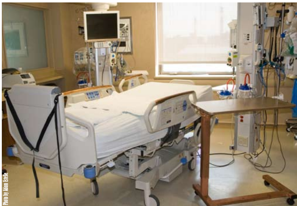
The copper effect —Copper components such as bed rails and an over-bed tray were installed in this ICU room as part of a three-site study on the metal's germ-killing effects.