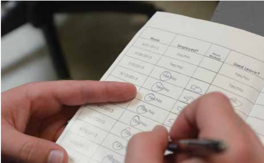
Researchers are tracking the employment outcomes of Veterans enrolled in the program.