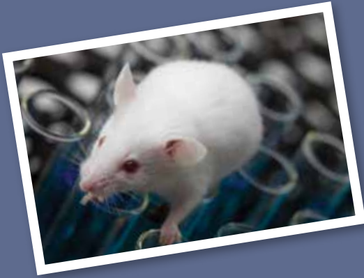
Mice exposed to methamphetamine display impaired memory.