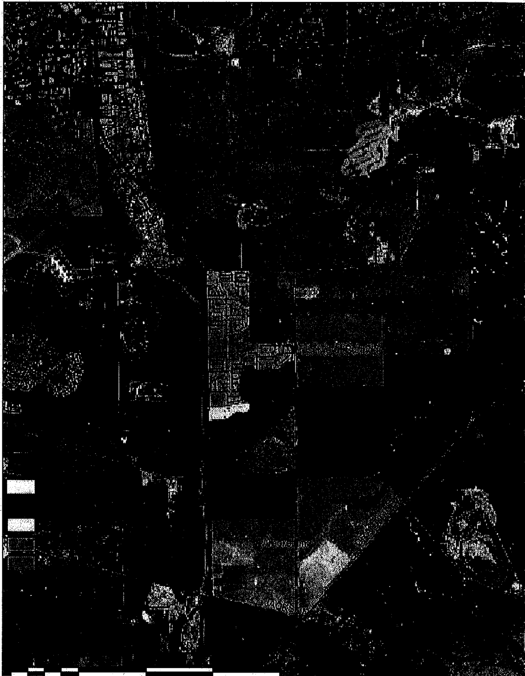
Figure 2 SunCreek Project Boundary