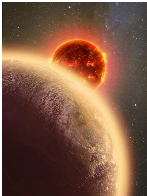
This work has been accepted for publication in the Astrophysical Journal. Artist's conception: Dana Berry / Skyworks Digital / CfA

Schaefer predicts that their model also will provide insights into other, similar exoplanets. For example, the system TRAPPIST-1 contains three planets that may lie in the habitable zone. Since they are cooler than GJ 1132b, they have a better chance of retaining an atmosphere.