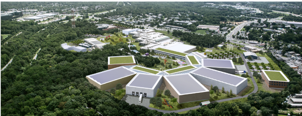
Project rendering of the Suitland Collections Center located in Suitland, Md.