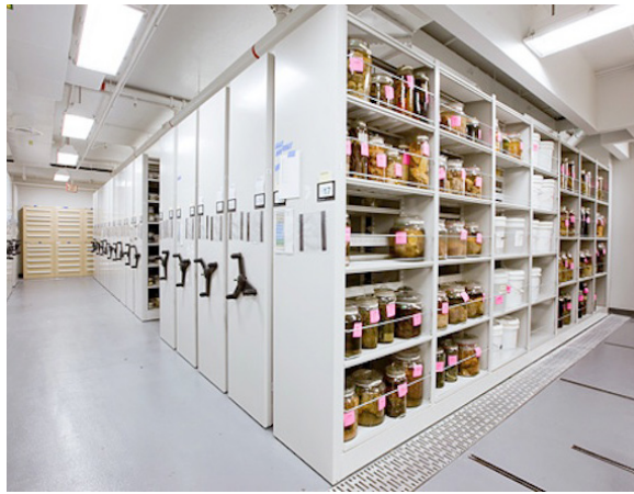
Collection space interiors: Inside the Dulles Collection Center — Module 1 (left). Collection storage space inside the Museum Support Center (right).