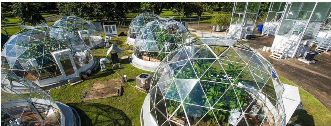
The Smithsonian Tropical Research Institute (STRI) Tropical Dome Project at Gamboa Outdoor Laboratories simulates extreme future climate scenarios and document the resulting effects on tropical trees, shrubs, vines and herbs.

Smithsonian climate change research is highly collaborative and engages many federal partners. The activities in Action Goal (3) typically involve one or more federal partners and coordination is achieved through the formal administrative structure of the network or project team. In many cases the relationship with federal partners is one of grantor (federal) and grantee (Smithsonian) in which case coordination is through the formal grant administration process.