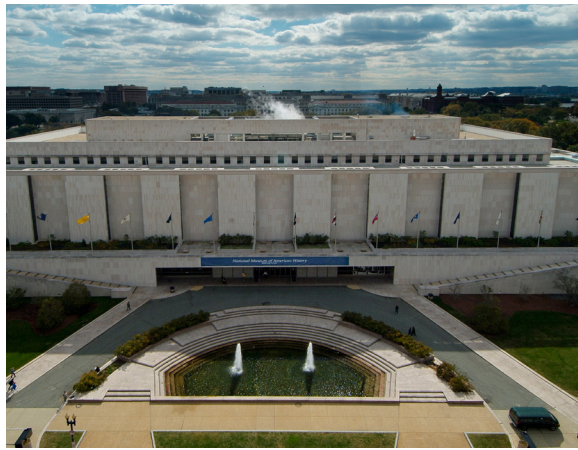
The Smithsonian is taking action to improve protection against flooding. This includes project plans for The Museum of the American Indian in New York City (left) and the National Museum of American History (right).