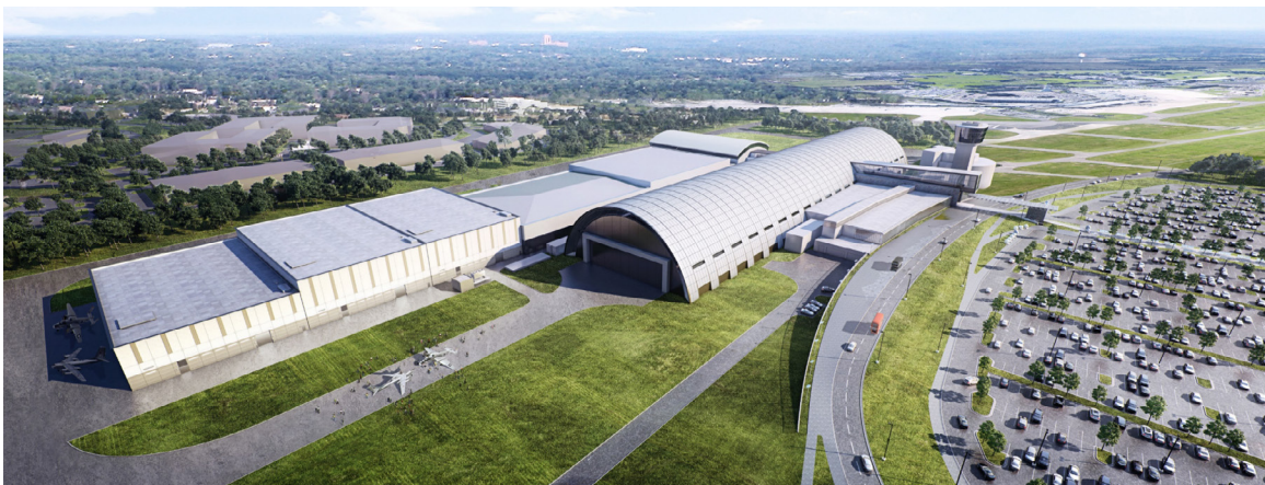
Project rendering of the Dulles Collections Center at the National Museum of Air and Space — Udvar Hazy Center.

The Smithsonian Collections Space Committee provides vision, leadership, coordination, and review of collections space projects and policies.