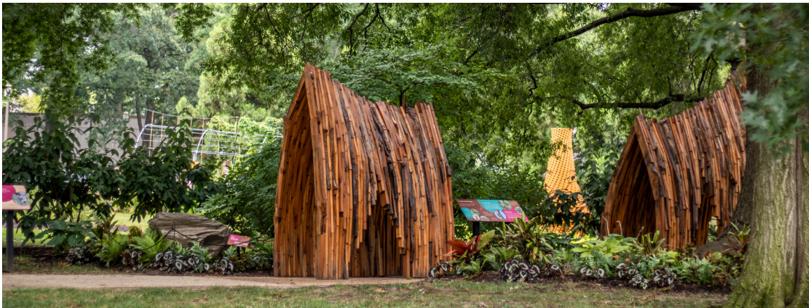
Smithsonian Gardens Habitat includes 14 distinct exhibits in indoor and outdoor garden spaces at various Smithsonian museums, all exploring a central theme: protecting habitats protects life.