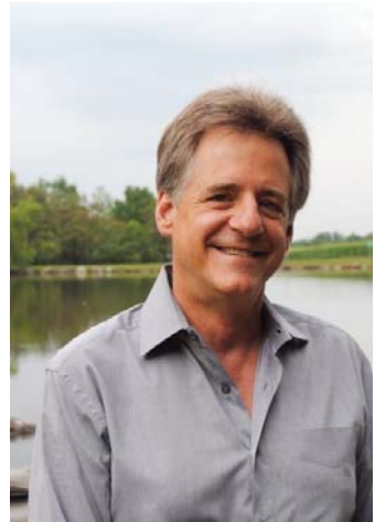
Figure 1 Photograph of author Jeff Shaara, used by permission.

The Fateful Lightning begins with the period after Union General William T. Sherman's occupation of Atlanta. Sherman's capture of the city ended the immediate political crisis by ensuring Lincoln's reelection. However, Sherman realized there was also a political and military crisis to be faced, particularly with his commander, General Ulysses S. Grant bogged down around Petersburg, Virginia. Sherman, with his knowledge of the South, understood that for the war to end, the level of Southerners' pain and suffering needed to be elevated. Shaara nicely allows us to see that Sherman's decision to march to the sea and to make Georgia howl was a decision of the highest strategic order; Sherman—as we see through the author's eye—wanted the war to be over but also knew he must become more brutal. The beauty of this new work is that a reader can appreciate it as a stand-alone volume.