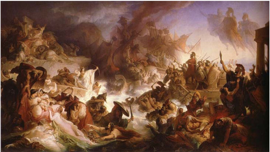
Figure 1 Battle of Salamis (Die Seeschlacht bei Salamis) . Oil on canvas by Wilhelm von Kaulbach, c. 1868.

Watching from his throne, Xerxes could see the battle of Salamis in 480 BC. Themistocles had engaged in a subterfuge, which tricked the Persians into attacking the Greek fleet in the straits around Salamis. After the naval defeat, Xerxes placed the blame on his Phoenician captains and executed them; something