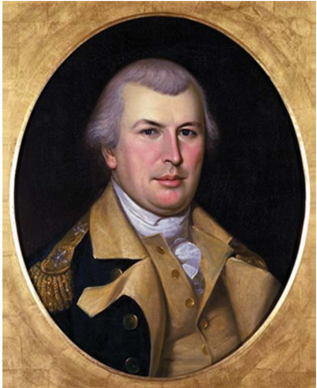
Figure 2 Nathanael Greene . Original portrait painted from life by Charles Wilson Peale, c. 1783.

Events in the South quickly began to unravel for Cornwallis and the British cause. Enraged by Tarleton's defeat at Cowpens, Cornwallis threw all his resources into overtaking Morgan and re-capturing the British prisoners that Morgan was rapidly escorting northward, away from the British strongpoints in South Carolina. The British and American forces set a