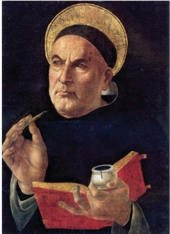
Figure 2 St. Thomas Aquinas . Attributed to Botticelli, c. 1481-1482.

Aquinas instead joined the newly formed Order of Preachers, also known as the Dominicans. This order founded expressly for the purpose of combating heresy through disputation and its members soon became the theological “shock-troops” of the Church. As Aquinas continued his education at Paris and Cologne, he devoured the newly re-discovered works of Aristotle and joined in the attempt to reconcile his philosophical approach with the Christian faith. In doing so, historians eventually recognized him as the greatest of the scholastic theologians.