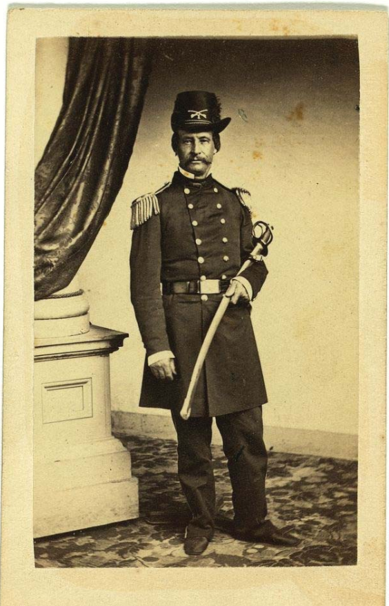
Figure 2 Officer David Hunter, full-length portrait in full military dress. Photographic print on carte de visite mount: albumen.

Upon entering the Valley, Hunter defeated the Confederates under General W. E. Jones at the Battle of Piedmont on June 5. He then moved on to Staunton where part of his army destroyed the warehouses and supplies stored there, along with the “steam mill, foundry, and carriage and woolens factories,” 13 while others began destroying the