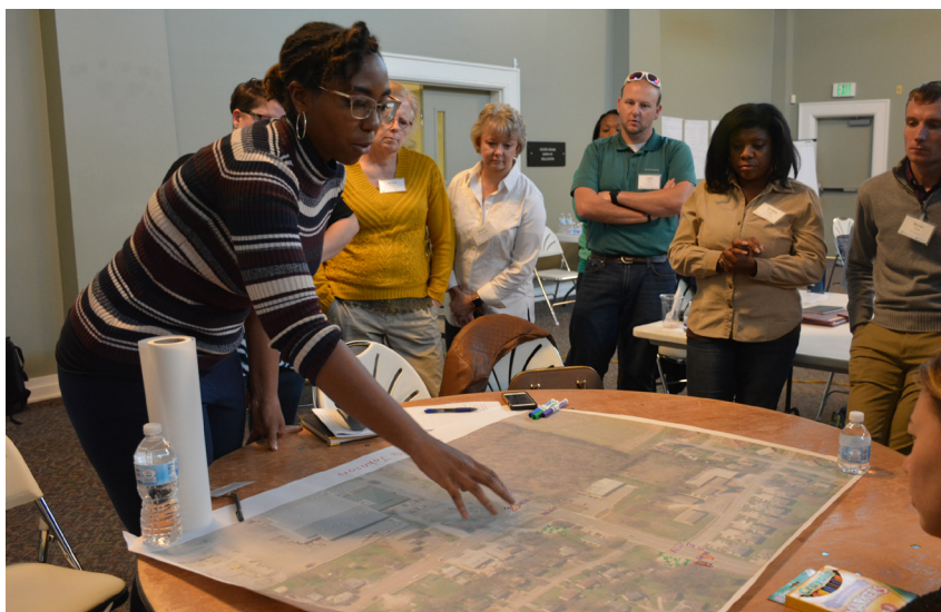
Huntsville representatives participating in the Safe Streets Academy in 2019 along with staff from Pittsburgh, PA and Durham, NC.