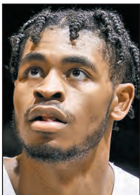
CAM THOMAS Made remark in his postgame interview.

The Nets will rely on Thomas, who has averaged 10.6 points per game this season, to help plug the role vacated by Irving and Kevin Durant, who were traded to the Mavericks and Suns, respectively, at the NBA trade deadline.