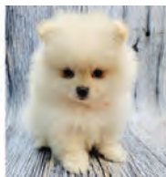
POMERANIAN PUPPIES Adorable males and females, toy or teacup sizes, shots and papers. Call 718-614-3968