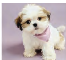
SHIH-TZU PUPPIES Beautiful Males & Females Price to Sell Call 718-306-4136

GERMAN SHEPHERD PUPPIES AKC rgstrd visit the website www.germanshepherdinct.com Call for details at 203-815-8049