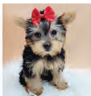
YORKIE PUPPIES ADORABLE, pure bred, toy & teacup sizes. Call 718-306-4136