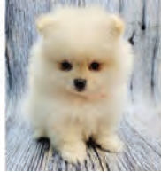
POMERANIAN PUPPIES Adorable males and females, toy or teacup sizes, shots and papers. Call 718-614-3968