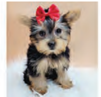
YORKIE PUPPIES ADORABLE, pure bred, toy & teacup sizes. Call 718-306-4136