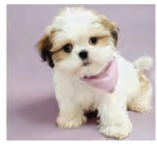
SHIH-TZU PUPPIES Beautiful Males & Females Price to Sell Call 718-306-4136