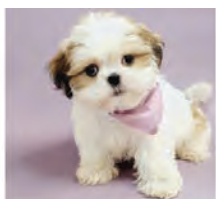
SHIH-TZU PUPPIES Beautiful Males & Females Price to Sell Call 718-306-4136