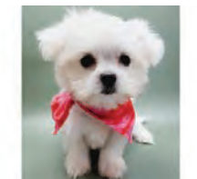
MALTESE PUPPIES Adorable males and females, toy or teacup sizes, shots and papers. Call 718-306-4136