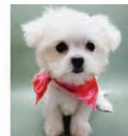
MALTESE PUPPIES Adorable males and females, toy or teacup sizes, shots and papers. Call 718-306-4136