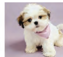
SHIH-TZU PUPPIES Beautiful Males & Females Price to Sell Call 718-306-4136