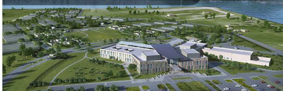
First Contract Awarded