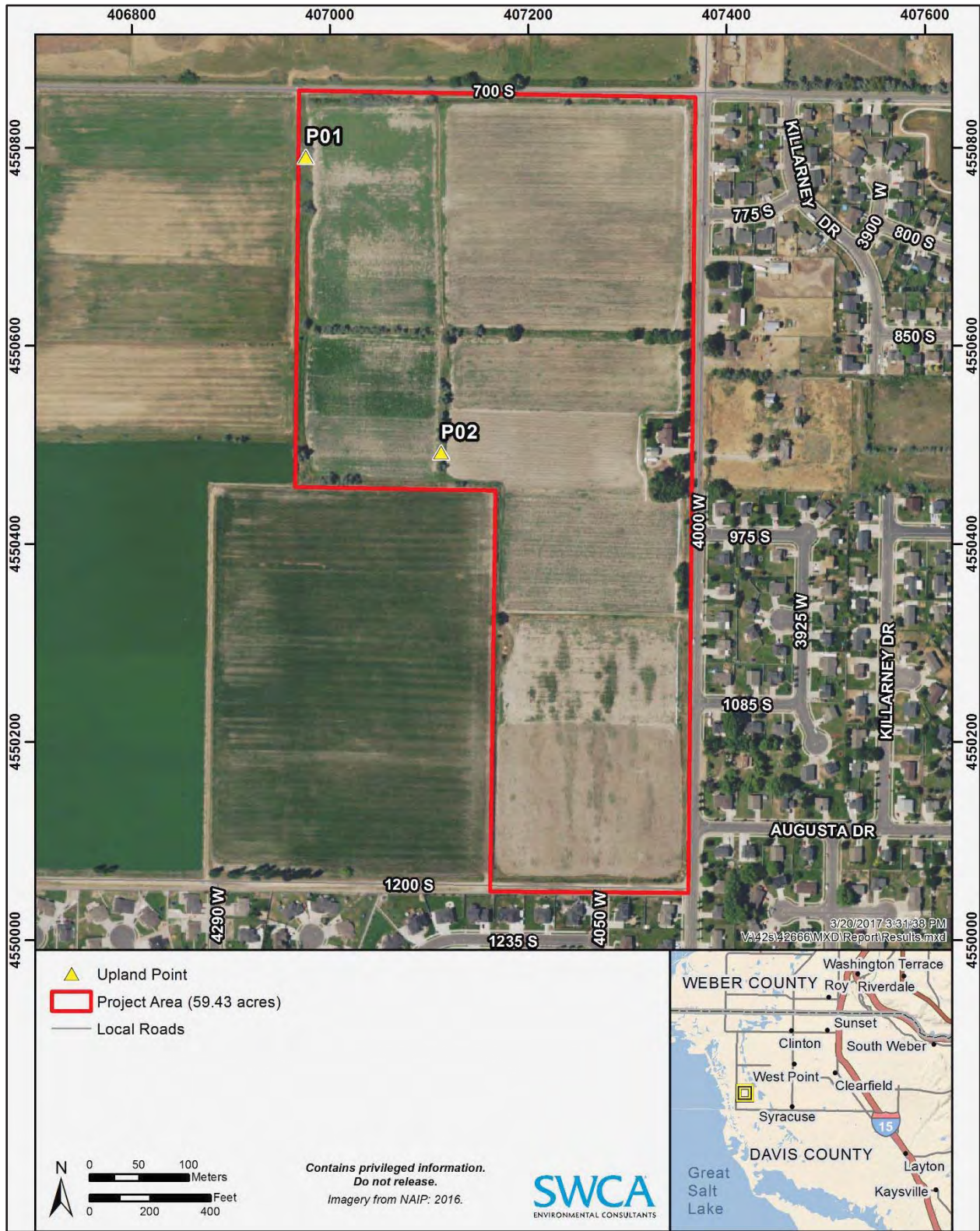
Figure F1. Results of the aquatic resource inventory March 16, 2017.