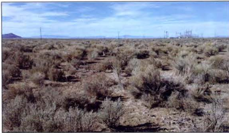
Photo Point 3 on Figure 2, looking downgradient where the Duggins Creek USGS map shows a blue line, indicating that a drainage exists here. No OHWM or other indication of channelized or ponded water was noted here.

Photo Point 3 on Figure 2, looking upgradient where the Duggins Creek USGS map shows a blue line, indicating that a drainage exists here. No OHWM or other indication of channelized or ponded water was noted here.