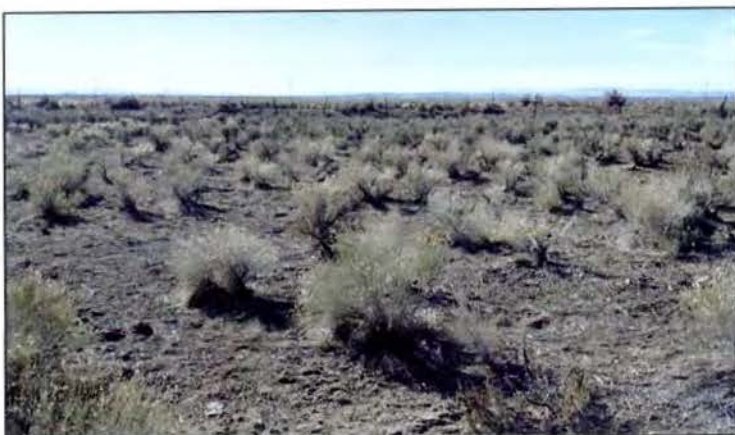
Photo Point 7 on Figure 2 looking downgradient where the Duggins Creek USGS map shows a blue line, indicating that a drainage exists here. No OHWM or other indication of channelized or ponded water was noted here.

Photo Point 7 on Figure 2 looking upgradient where the Duggins Creek USGS map shows a blue line, indicating that a drainage exists here. No OHWM or other indication of channelized or ponded water was noted here.