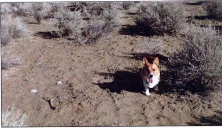
Photo Point 4 on Figure 2 showing ground conditions and lack of signs of water flow or ponding. Dog is about 16 inches high.