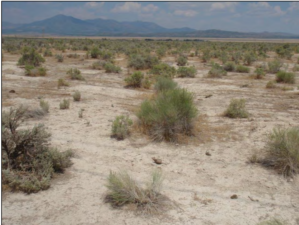
Figure B4. Looking east along flow path 2 at P05.