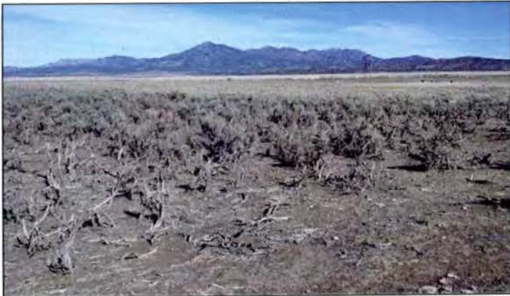
Photo Point 2 on Figure 2, looking upgradient where the Duggins Creek USGS map shows a blue line, indicating that a drainage exists here. No OHWM or other indication of channelized or ponded water was noted here.

Photo Point 1 on Figure 2, looking downgradient where the Duggins Creek USGS map shows a blue line, indicating that a drainage exists here. No OHWM or other indication of channelized or ponded water was noted here.