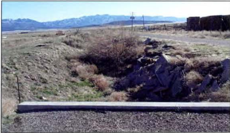
Photo Point 10 on figure 2 looking downgradient. The canal is obvious in this photo, although it is also filled in with brush and grasses, indicating that the canal has not been used for some time.