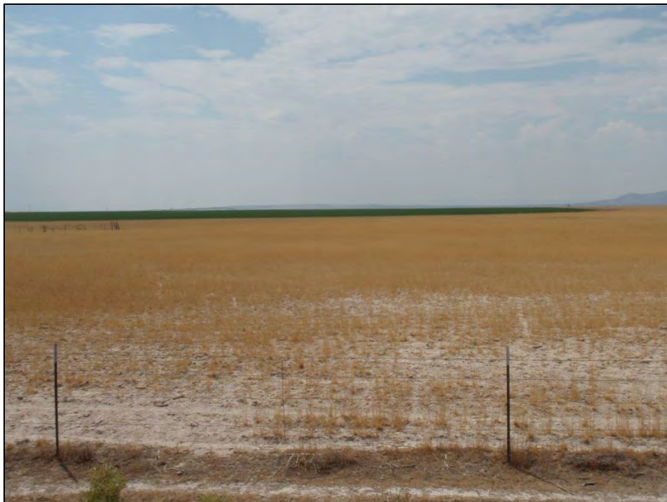
Figure B2. View west along flow path 1 at P06.