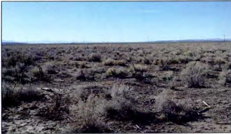
Photo Point 1 on Figure 2, looking downgradient where the Duggins Creek USGS map shows a blue line, indicating that a drainage exists here. No OHWM or other indication of channelized or ponded water was noted here.

Photo Point 1 on Figure 2, looking upgradient where the Duggins Creek USGS map shows a blue line, indicating that a drainage exists here. No OHWM or other indication of channelized or ponded water was noted here or in the canal, the edge of which is visible at the whitish, eroded slope.