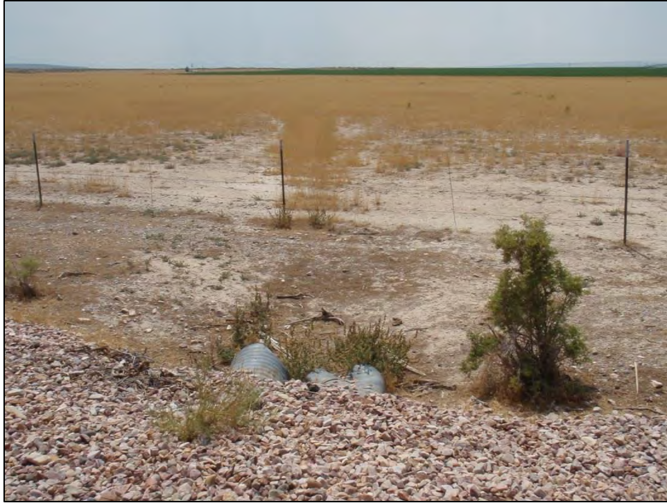
Figure B5. Looking west at culverts along flow path 2 at P05.