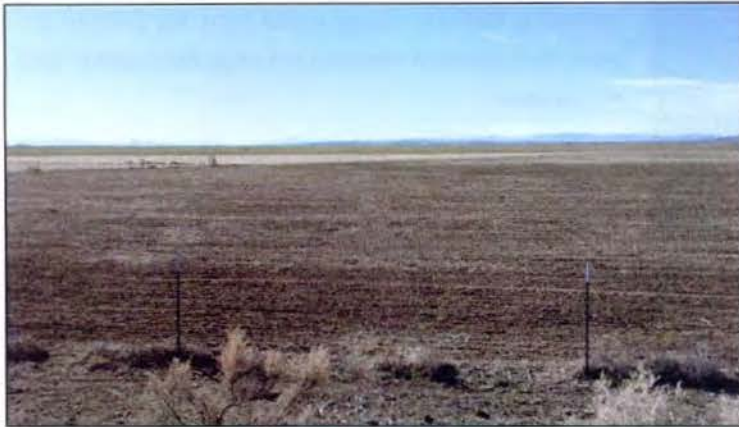
Photo Point 5 on Figure 2 looking downgradient at agricultural field. The lack of an OHWM, channel, or other indication of water movement is very clear in this photo.