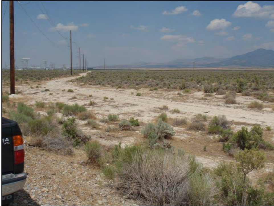
Figure B1. Overview of the study area.