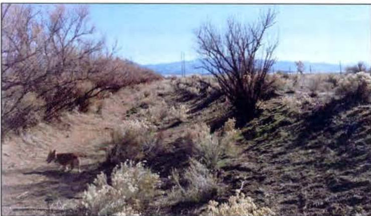
Photo Point 9 on Figure 2; canal, looking downgradient. Lounging cattle have made the canal bottom flat where dog is.

Photo Point 9 on Figure 2. This is the canal, looking upgradient, and is almost completely blown in with sand. The trees on the right are tamarisk. Cheatgrass is thick at the base of the tamarisks. No OHWM or other indication of channelized or ponding water was noted here.