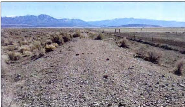
Photo Point 5 on Figure 2 looking southeast from top of old railroad grade. This grade acts as a dam that prevents water flowing off of the proposed project area from reaching down-gradient fields.