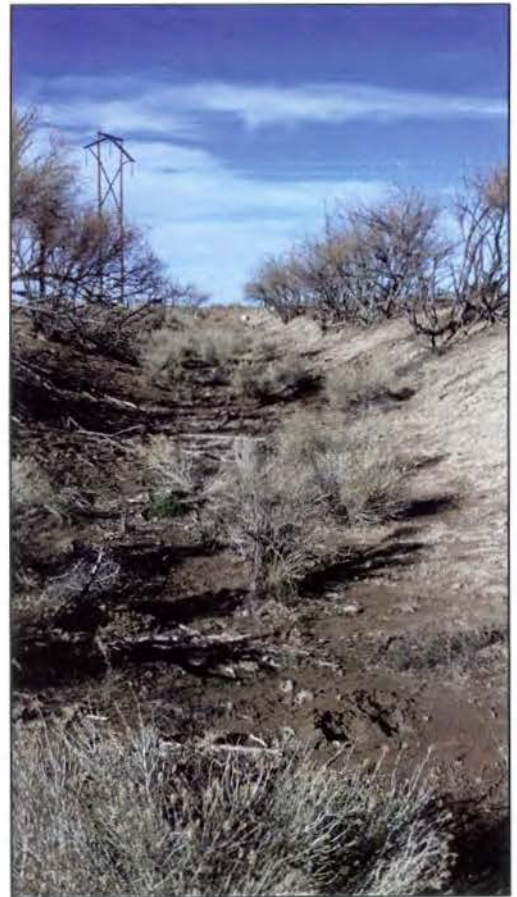
Photo Point 1 on Figure 2, looking upgradient at old Central Utah Canal. No OHWM or other indication of channelized or ponded water was noted here.