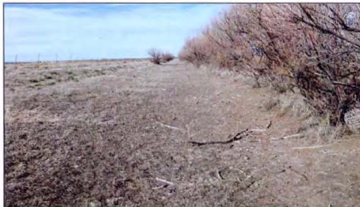
Photo Point 9 on Figure 2. This is the canal, looking upgradient, and is almost completely blown in with sand. The trees on the right are tamarisk. Cheatgrass is thick at the base of the tamarisks. No OHWM or other indication of channelized or ponding water was noted here.

Photo Point 8 on Figure 2 looking downgradient where the Duggins Creek USGS map shows a blue line, indicating that a drainage exists here. No OHWM or other indication of channelized or ponded water was noted here. The road in the middle ground is the north boundary of the proposed project area.