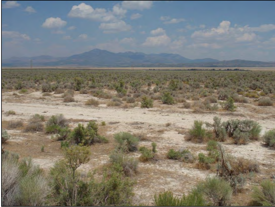
Figure B3. View east along flow path 1 at P06.