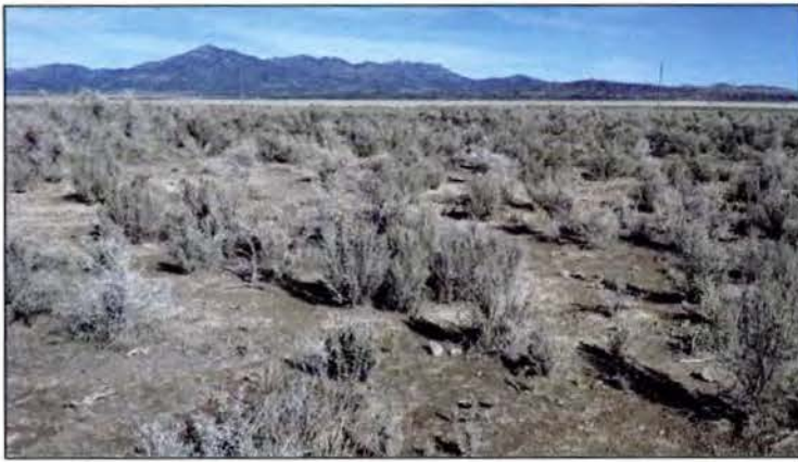
Photo Point 6 on Figure 2 looking upgradient where the Duggins Creek USGS map shows a blue line, indicating that a drainage exists here. No OHWM or other indication of channelized or ponded water was noted here.