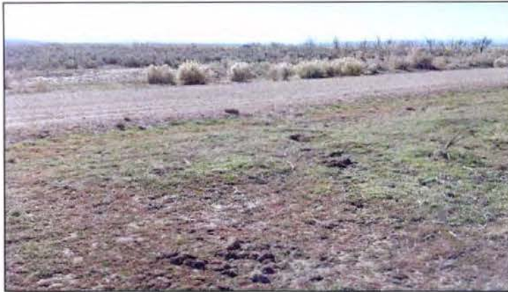
Photo Point 8 on Figure 2 looking downgradient where the Duggins Creek USGS map shows a blue line, indicating that a drainage exists here. No OHWM or other indication of channelized or ponded water was noted here. The road in the middle ground is the north boundary of the proposed project area.

Photo Point 8 on Figure 2 looking upgradient where the Duggins Creek USGS map shows a blue line, indicating that a drainage exists here. No OHWM or other indication of channelized or ponded water was noted here.