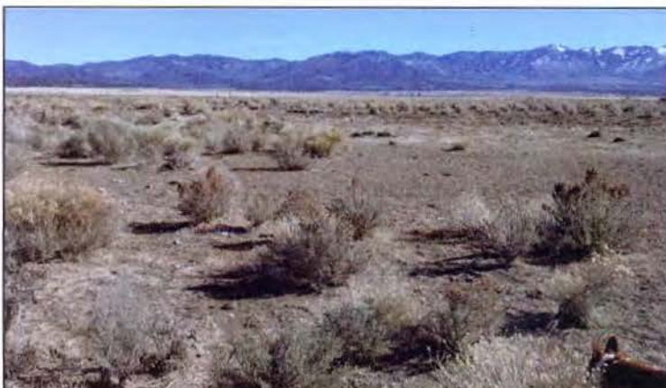
Photo Point 3A on Figure 2, looking upgradient. This area was not marked as a drainage but in the field looked to be at a lower elevation and more open than Point 3. However, no OHWM or other indicators were observed here.

Photo Point 3 on Figure 2, looking at surface conditions: there is no indication of water movement or ponding in the area.