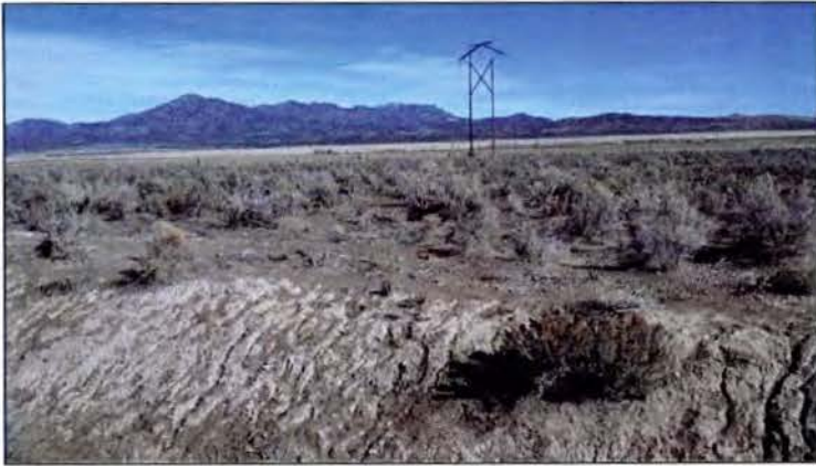
Photo Point 1 on Figure 2, looking upgradient where the Duggins Creek USGS map shows a blue line, indicating that a drainage exists here. No OHWM or other indication of channelized or ponded water was noted here or in the canal, the edge of which is visible at the whitish, eroded slope.