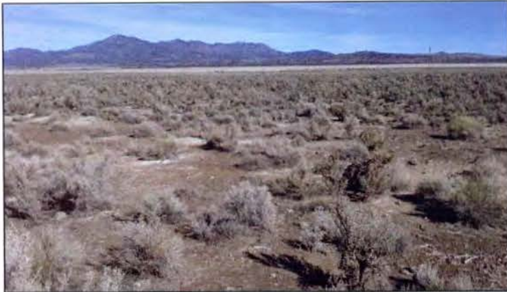
Photo Point 5 on Figure 2, looking upgradient where the Duggins Creek USGS map shows a blue line, indicating that a drainage exists here. No OHWM or other indication of channelized or ponded water was noted here.