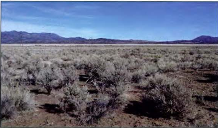
Photo Point 4 on Figure 2, looking upgradient where the Duggins Creek USGS map shows a blue line, indicating that a drainage exists here. No OHWM or other indication of channelized or ponded water was noted here.