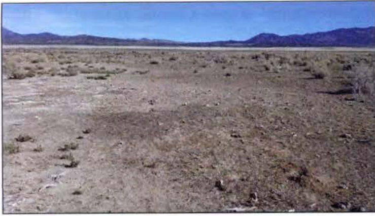
Photo Point 3 on Figure 2, looking upgradient where the Duggins Creek USGS map shows a blue line, indicating that a drainage exists here. No OHWM or other indication of channelized or ponded water was noted here.