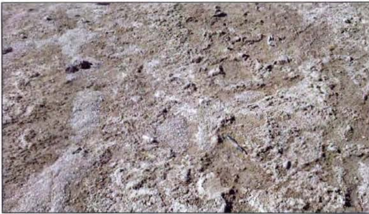
Photo Point 3 on Figure 2, looking at surface conditions: there is no indication of water movement or ponding in the area.

Photo Point 3 on Figure 2, looking downgradient where the Duggins Creek USGS map shows a blue line, indicating that a drainage exists here. No OHWM or other indication of channelized or ponded water was noted here.