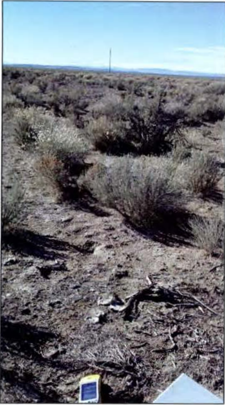
Photo Point 3A looking downgradient and at the ground surface. No OHWM or other indicators were observed here.