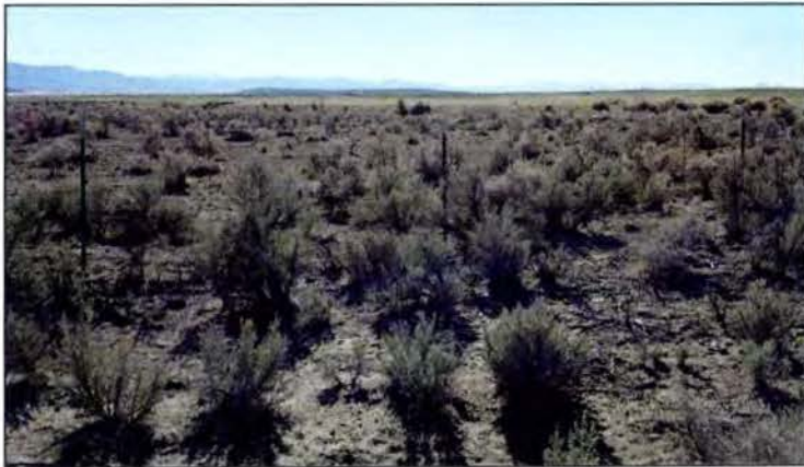
Photo Point 6 on Figure 2 looking downgradient where the Duggins Creek USGS map shows a blue line, indicating that a drainage exists here. No OHWM or other indication of channelized or ponded water was noted here.

Photo Point 6 on Figure 2 looking upgradient where the Duggins Creek USGS map shows a blue line, indicating that a drainage exists here. No OHWM or other indication of channelized or ponded water was noted here.