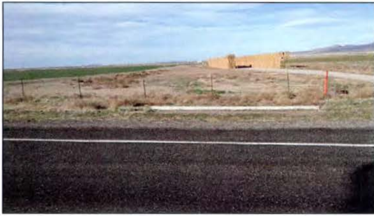
Photo Point 10 on Figure 2 looking upgradient. This is where the canal is supposed to cross the road. There are vague remnants of the canal in the brushy area to the left and in front of the haystacks.