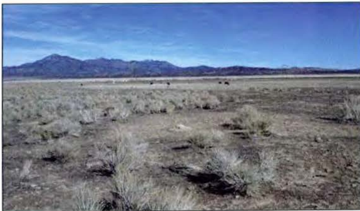
Photo Point 7 on Figure 2 looking upgradient where the Duggins Creek USGS map shows a blue line, indicating that a drainage exists here. No OHWM or other indication of channelized or ponded water was noted here.

Photo Point 6 on Figure 2 looking downgradient where the Duggins Creek USGS map shows a blue line, indicating that a drainage exists here. No OHWM or other indication of channelized or ponded water was noted here.