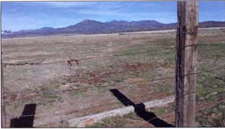
Photo Point 8 on Figure 2 looking upgradient where the Duggins Creek USGS map shows a blue line, indicating that a drainage exists here. No OHWM or other indication of channelized or ponded water was noted here.