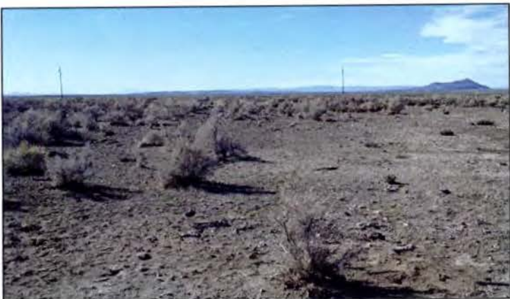
Photo Point 2 on Figure 2, looking downgradient where the Duggins Creek USGS map shows a blue line, indicating that a drainage exists here. No OHWM or other indication of channelized or ponded water was noted here.

Photo Point 2 on Figure 2, looking upgradient where the Duggins Creek USGS map shows a blue line, indicating that a drainage exists here. No OHWM or other indication of channelized or ponded water was noted here.