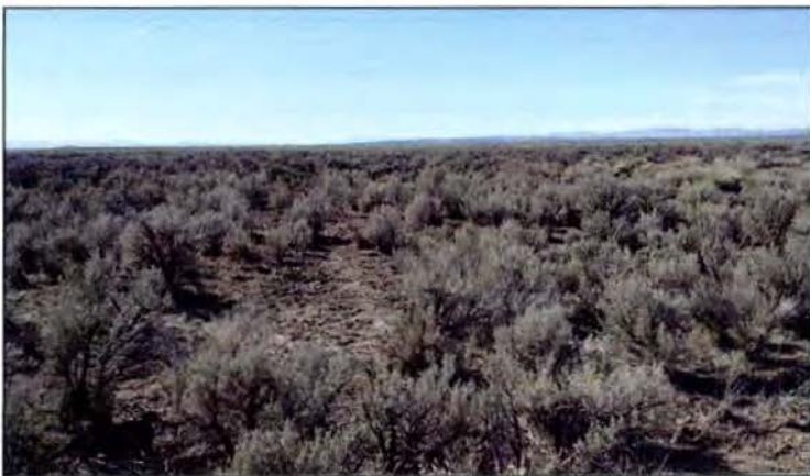
Photo Point 4 on Figure 2, looking downgradient where the Duggins Creek USGS map shows a blue line, indicating that a drainage exists here. No OHWM or other indication of channelized or ponded water was noted here