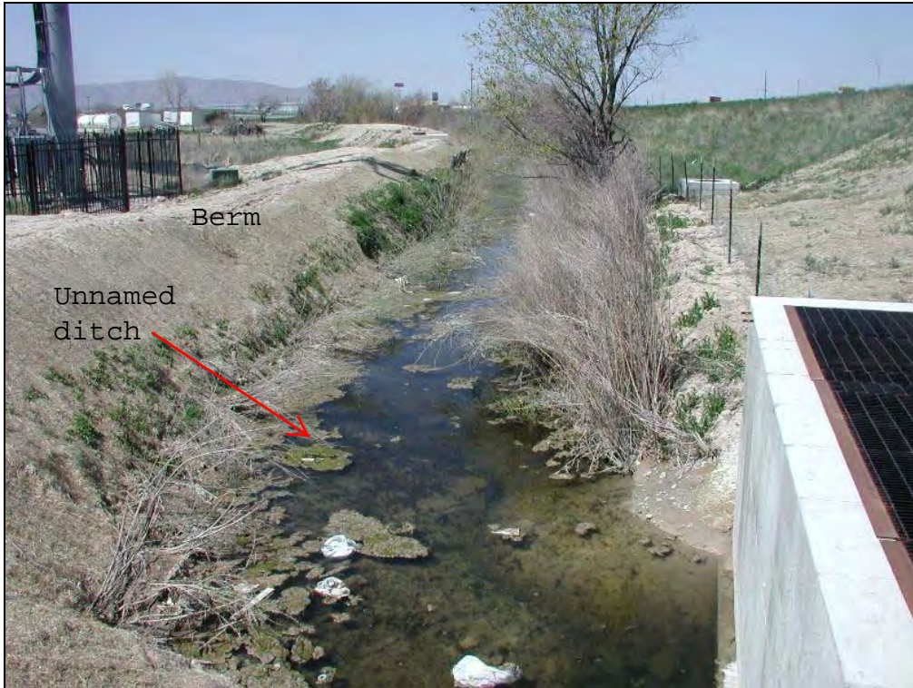
Unnamed Ditch (RPW) looking west (before water was removed)