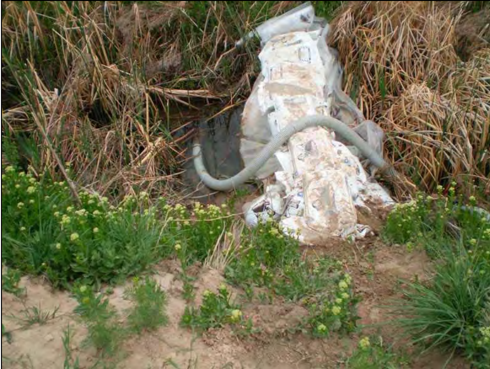
Dam constructed across the unnamed ditch (RPW) to remove water.