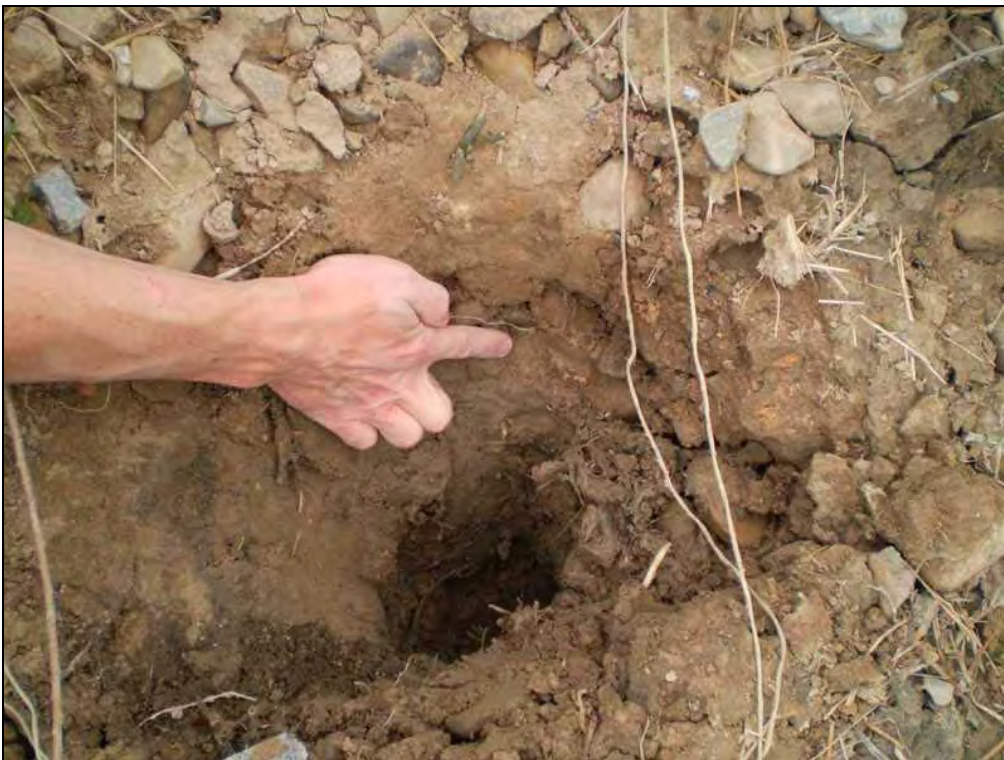
Test hole in ditch bank to determine presence of a hydrologic connection. Finger pointing to saturation line on bank of ditch. Approximately 12 inches above the bottom of the ditch.