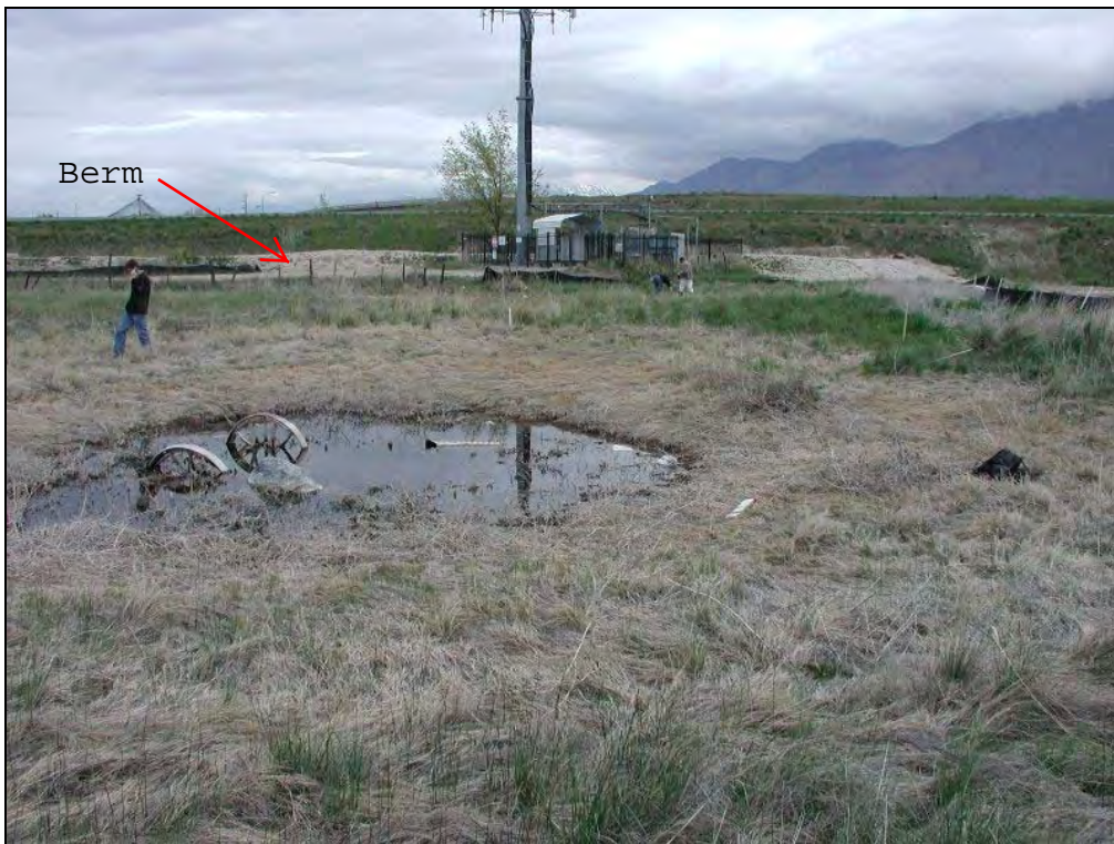
Wetland W2 looking north toward the freeway