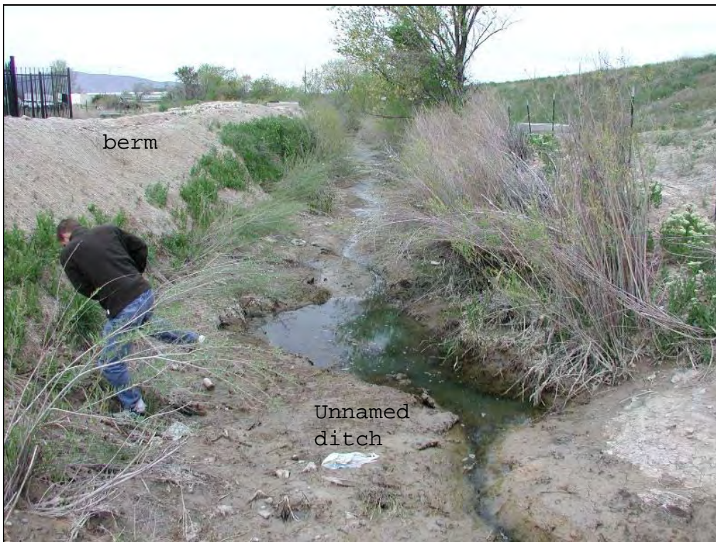
Unnamed Ditch after water was removed to determine presence of water seepage from adjacent wetlands