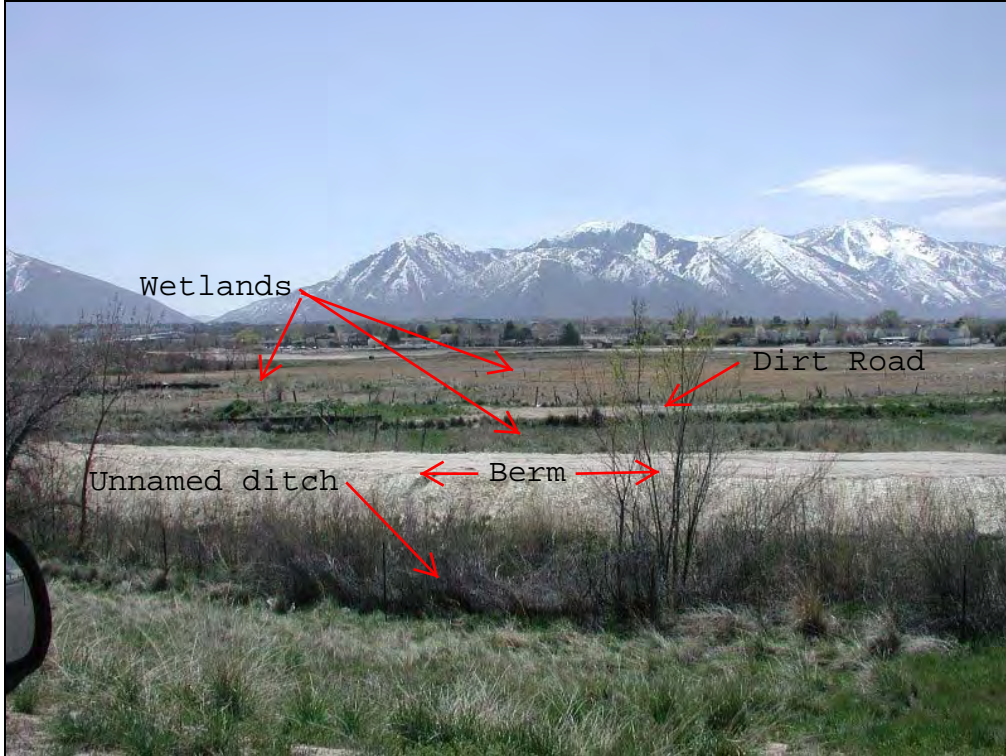
Overall photo of site standing on freeway shoulder looking south