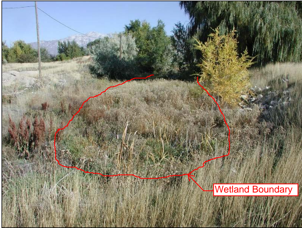
Plat B. South edge of north wetland looking north