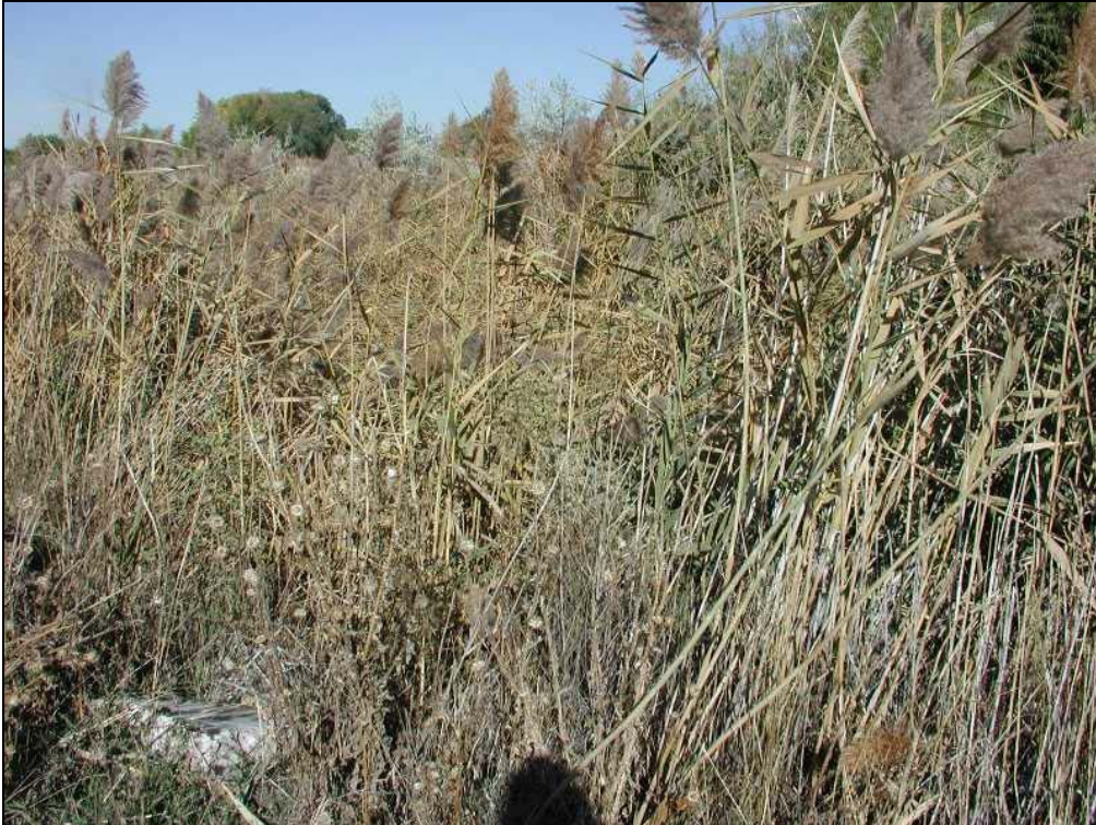
Plat B. South end of the south wetland looking north through a stand of common reed.