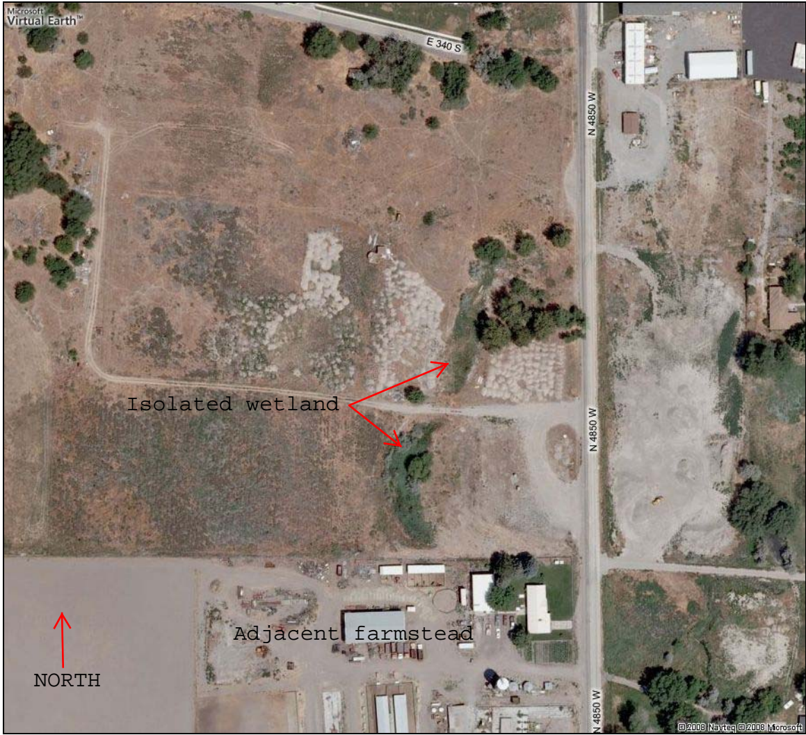
Isolated wetland location