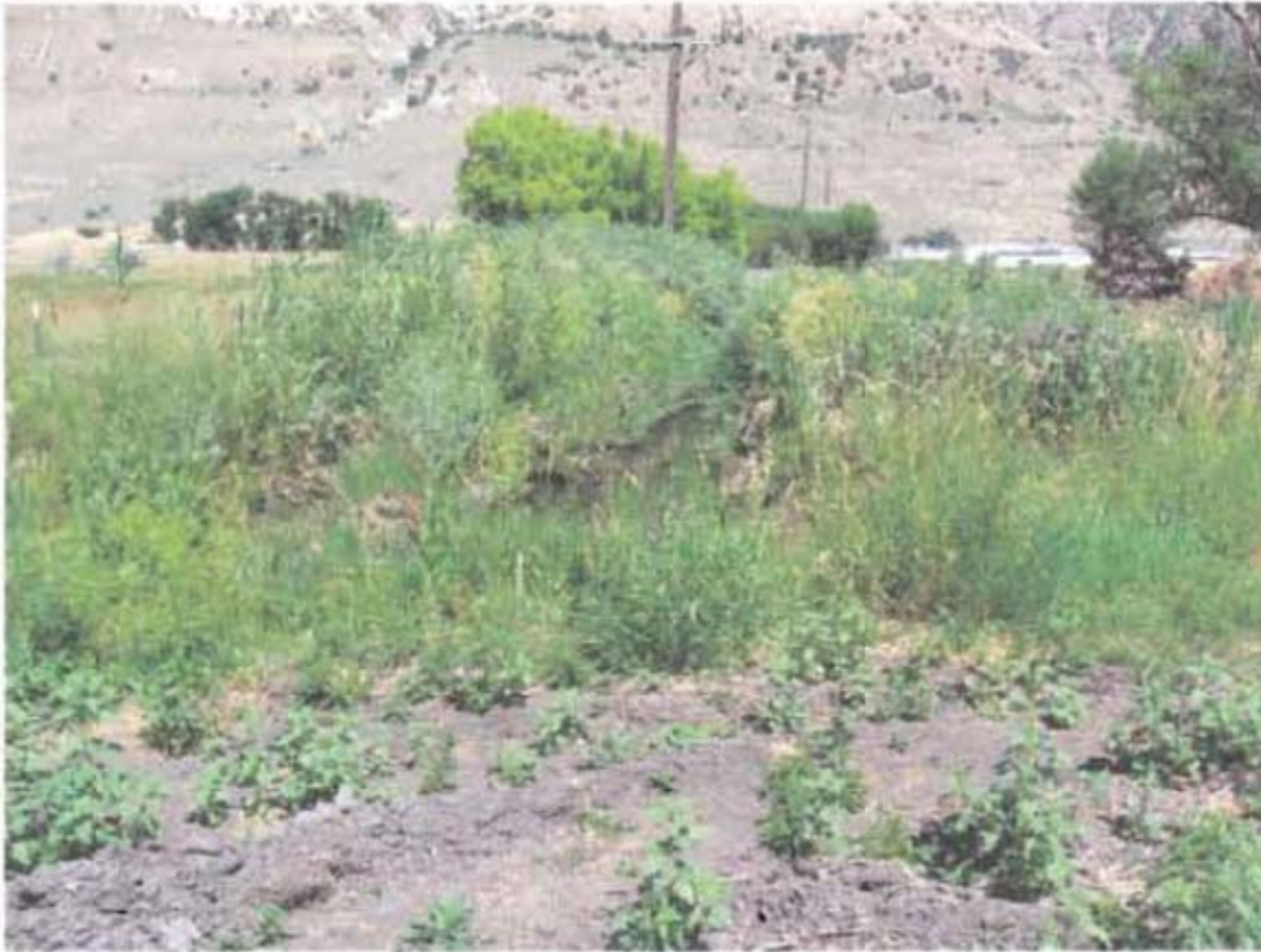
Photo 8. Looking east at area where two ditch lines converge (July 13, 2007).