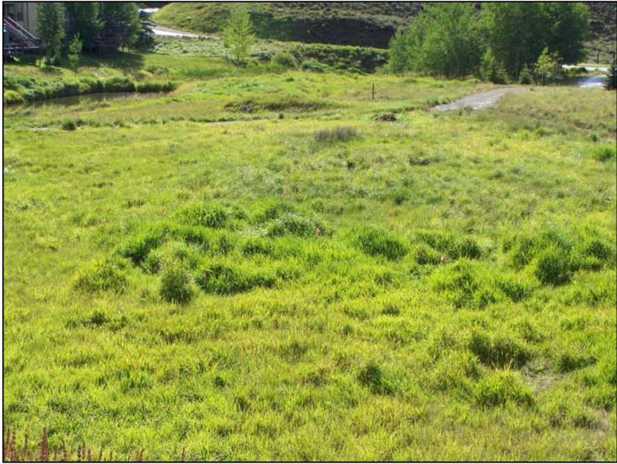
Photo 5. Wetland B looking towards Wetland C.