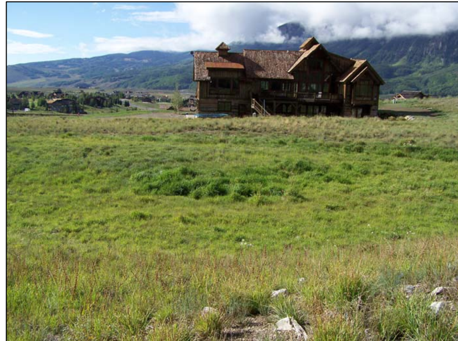
Photo 6. Wetland B looking southwest.