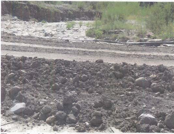
Figure 1 Looking downstream at road crossing