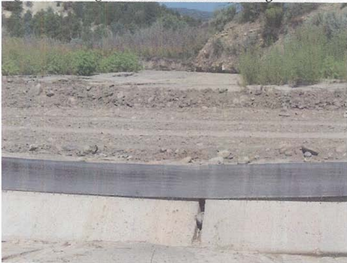
Figure 2 Looking upstream at road crossing