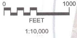
Figure 3 Delineated Wetlands