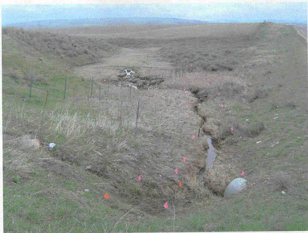
Photo 1. South Climb Lane Wetland.