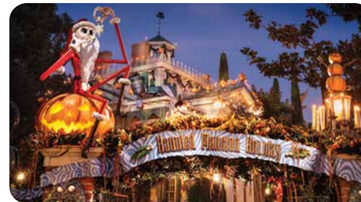
Jack Skellington and Haunted Mansion Holiday inspired by Tim Burton’s The Nightmare Before Christmas

The Disney Characters love dressing up for Halloween, and this year Mickey Mouse and Minnie Mouse are all decked out in brand-new costumes that will bring a smile to your face when you see them at Disneyland® Park.