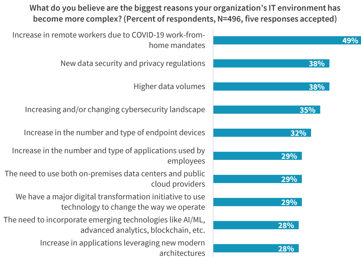
Figure 1. Top Ten Drivers of IT Complexity

domain experts such as storage administrators. 3 These challenges are compelling IT organizations to look for ways to simplify and focus on what matters most to the business as a whole.