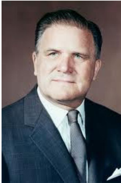
James Webb, c. 1966

Webb's energy was evident during his 12 years on the Board of Regents. When he first joined the Board, he found that it did not play a particularly active role in the affairs of the Smithsonian. Webb subsequently used his skills as a management specialist to focus on modernizing the Smithsonian's management. He served as chair of the Executive Committee and, in collaboration with Secretary S. Dillon Ripley, encour-