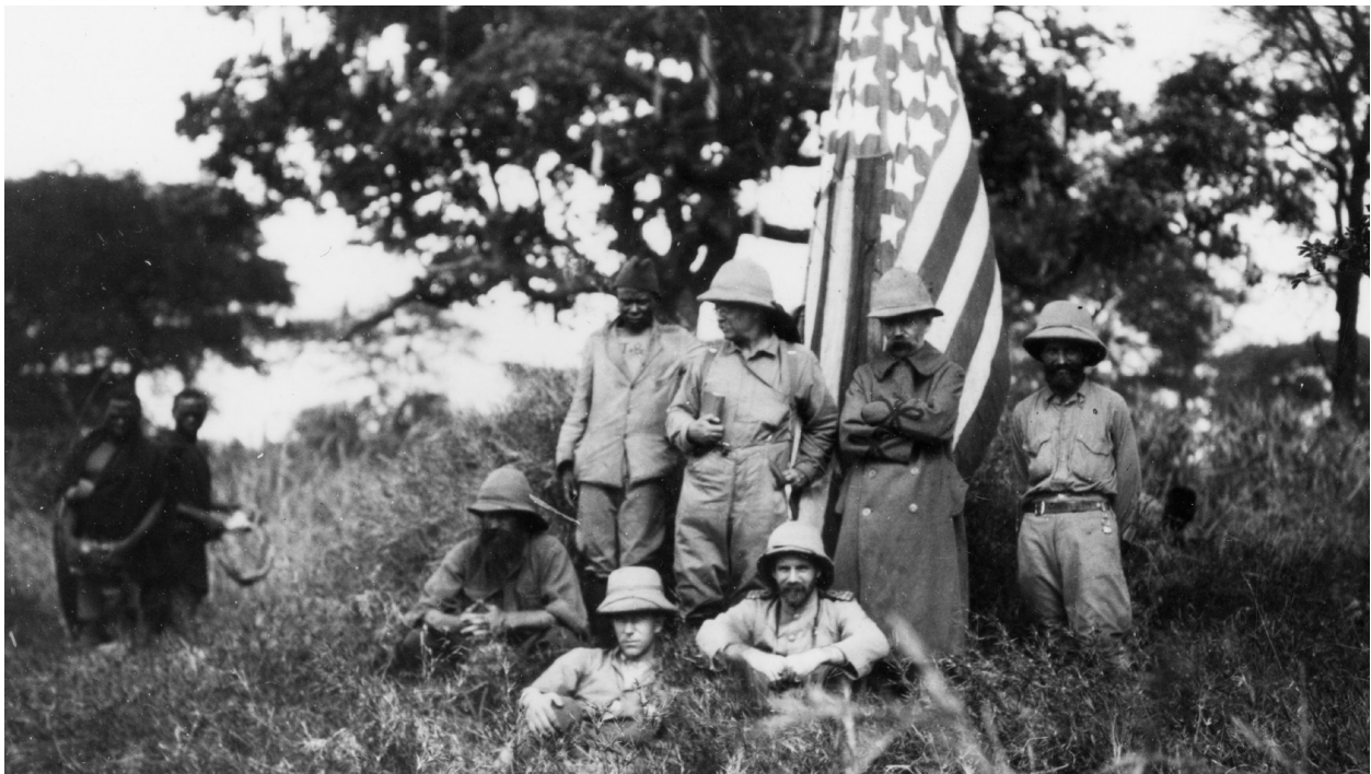
Former President Theodore Roosevelt (left of flag) and other members of the Smithsonian expedition party to Africa, where he collected natural history specimens for the U.S. National Museum and live animals for the National Zoological Park

At one point there were plans to build a museum in his honor next to what is now the Natural History Museum.