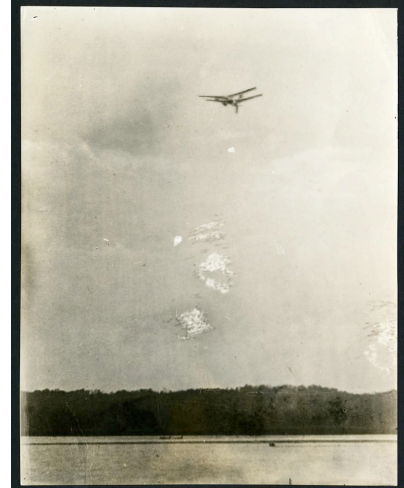
An instantaneous photograph by Alexander Graham Bell of Langley Aerodrome No. 5 in flight on May 6, 1896

the Smithsonian in 1904 when Smithson's cemetery plot was going to be moved for rock quarrying.