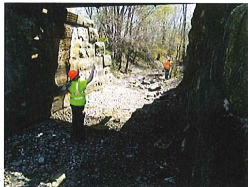
Culvert 46: Looking east within Harold’s Hole