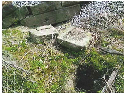
Culvert 29: Looking east at Culvert 29 and collapsed tile to the west