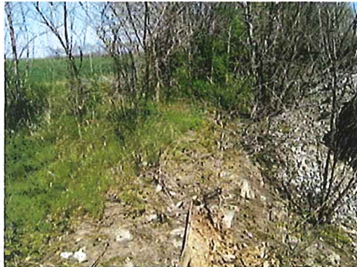
Culvert 46: Looking northwest along Harold’s Hole