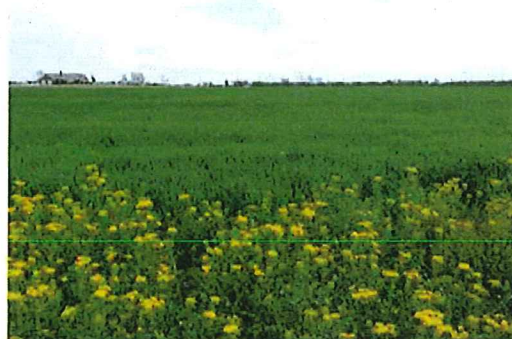
Culvert 18: Looking east from Culvert 18