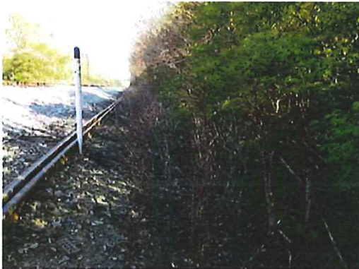
Culvert 11: Looking south on east end of Culvert 11