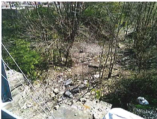
Culvert 46: Looking east over Harold’s Hole