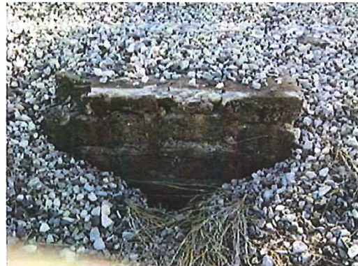
Culvert 11: Looking east at Culvert 11