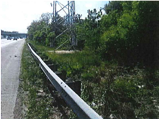
Culvert 1: Looking west from I-465 wingwall