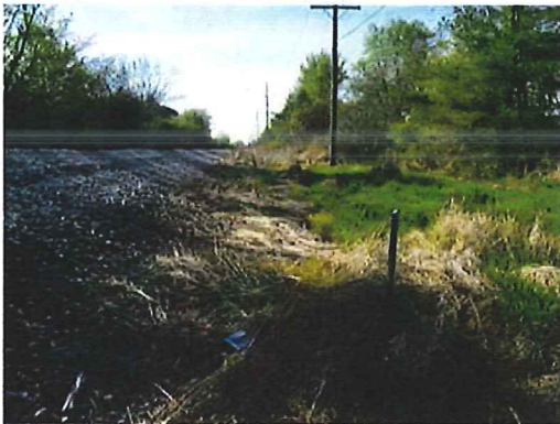
Culvert 11: Looking south on west side of culvert