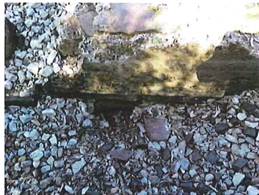
Culvert 11: Looking west at Culvert 11