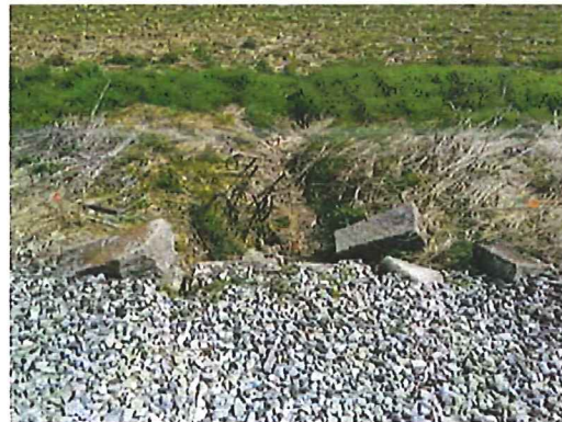
Culvert 29: Looking east along UNT 15