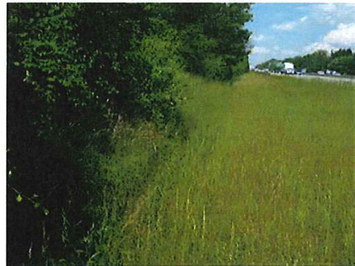
Culvert 1: Looking east from east side of northern I-465 wing wall