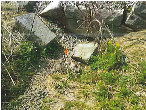
Culvert 29: Looking west at Culvert 29