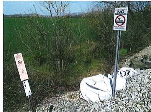
Culvert 46: Looking northwest above Harold’s Hole