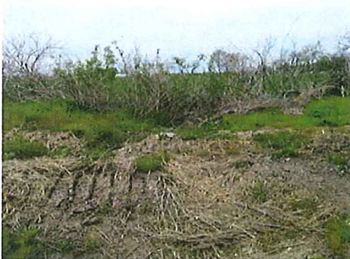
Culvert 18: Looking west from Culvert 18