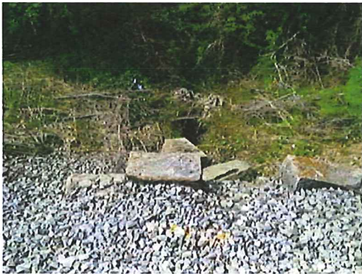
Culvert 29: Looking west along UNT 15