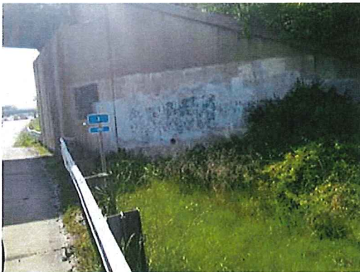
Culvert 1: Looking west from east side of I-465 wingwall