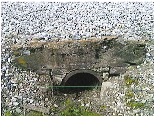
Culvert 18: Looking west at Culvert 18