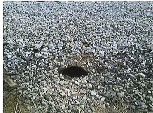
Culvert 18: Looking east at Culvert 18