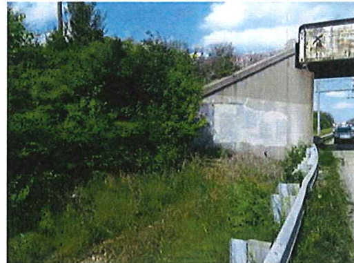
Culvert 1: Looking east at northern I-465 wingwall on west side of structure