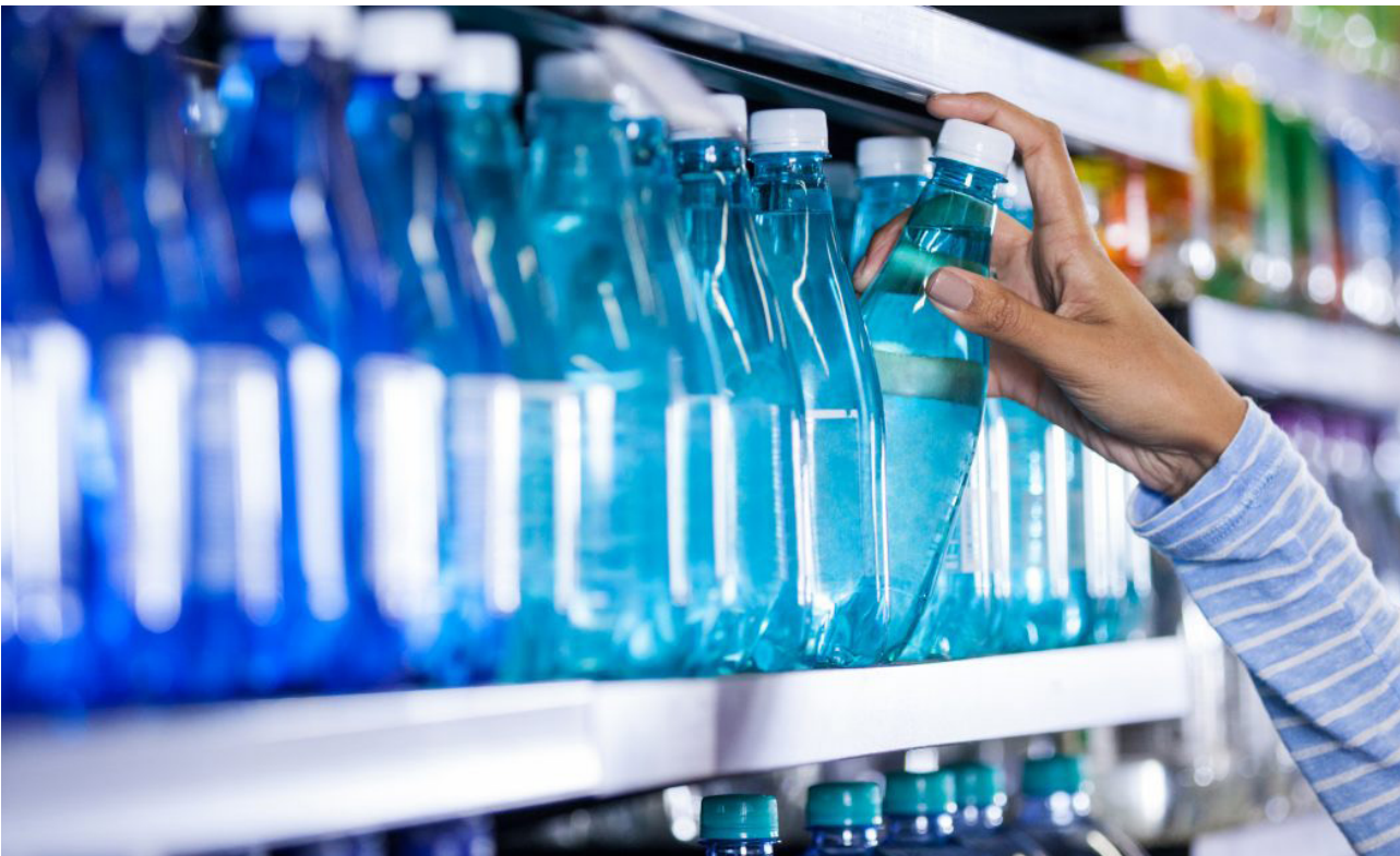
40% OF URBAN RESIDENTS DRINK BOTTLED WATER.

Finally, despite the negative news on water, which contradicts Xi Jinping's push for "positive energy", far more transparency, information, testing, monitoring and discussion needs to go on, to sensitise people to a problem which must transcend Party politics and interests.