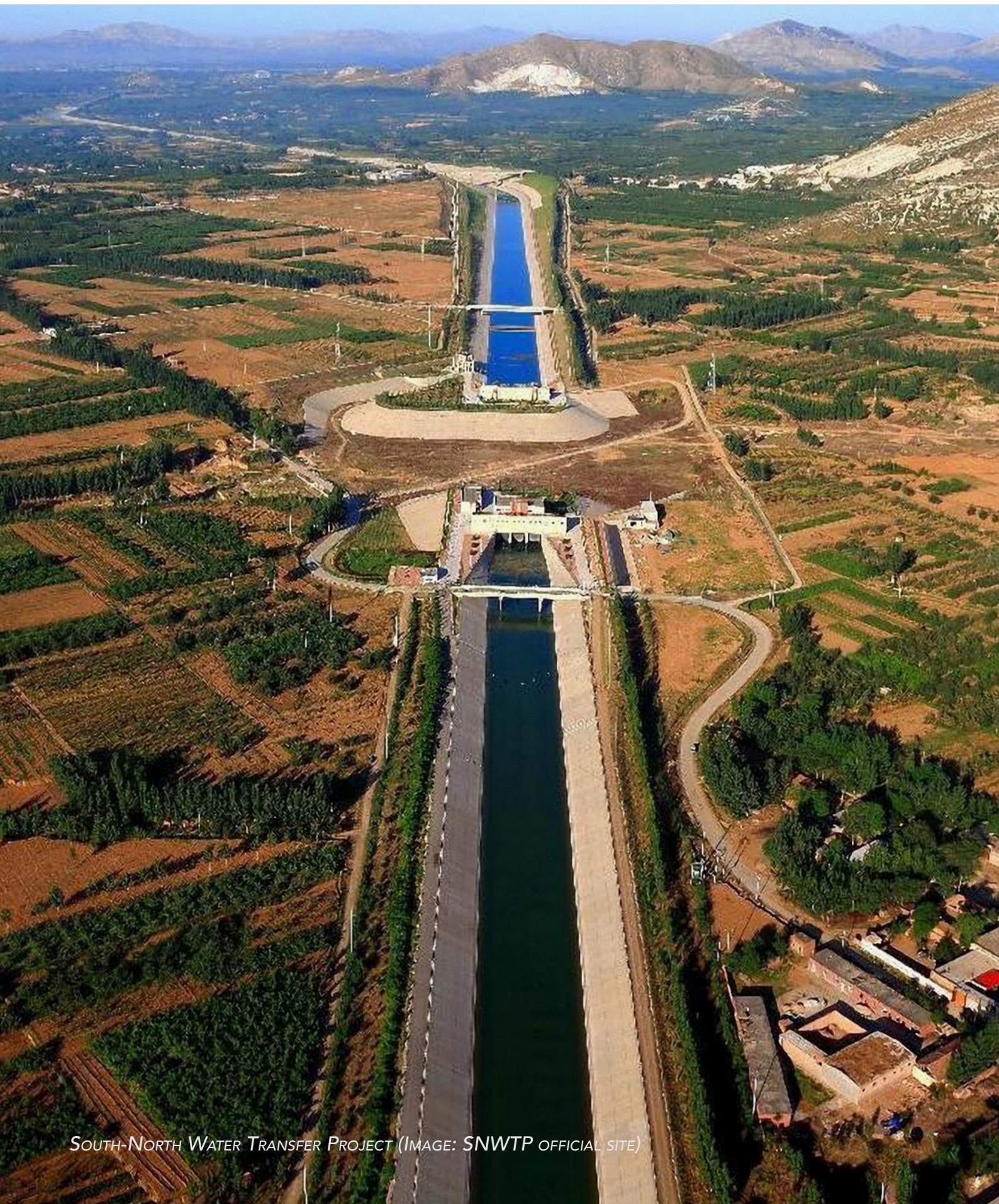
SOUTH-NORTH WATER TRANSFER PROJECT