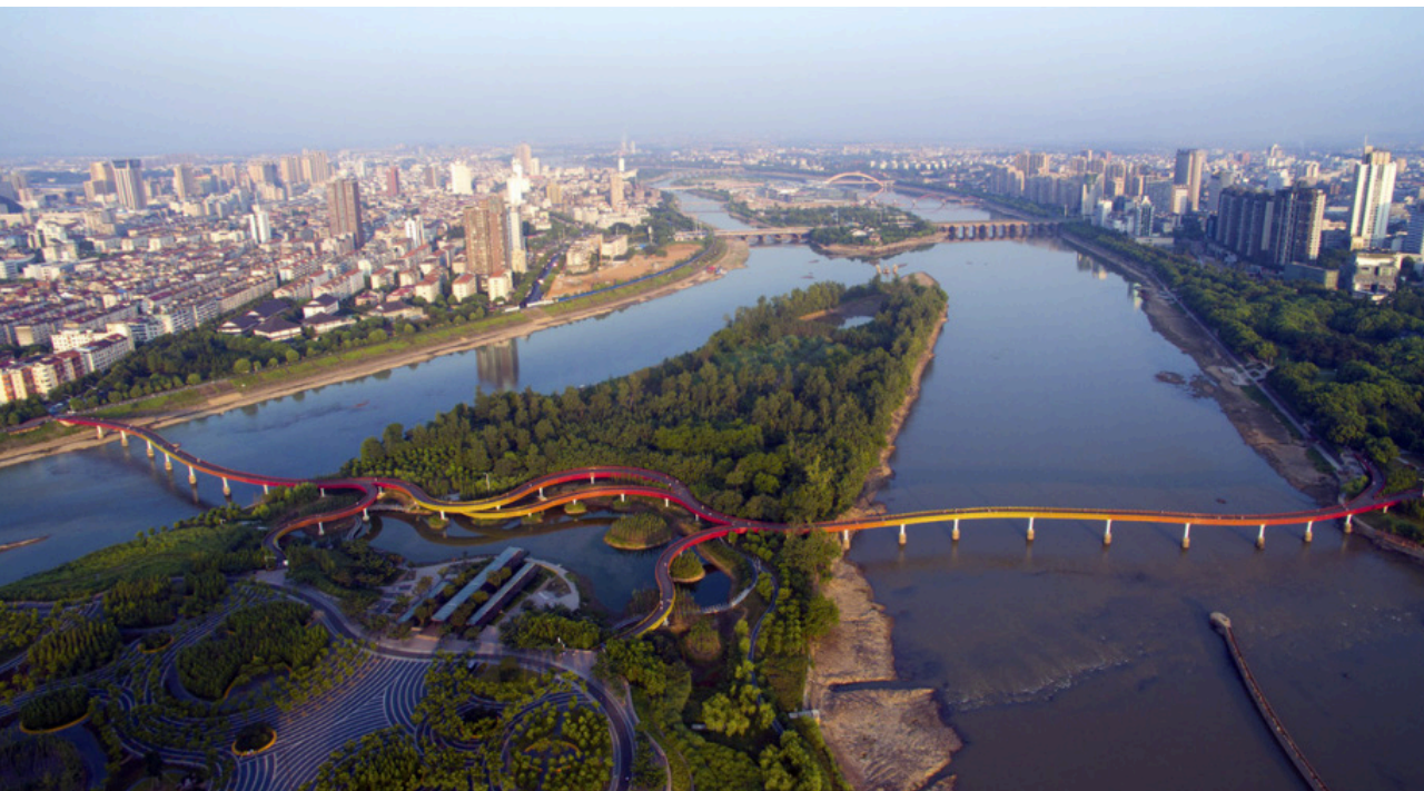
A SPONGE CITY PROJECT IN DESIGNED BY TURENSCAPE: YANWEIZHOU PARK IN JINHUA CITY (IMAGE: TURENSCAPE)

Some local governments are more active in publicity about the need to save water than others (oddly the message seems not to be coming across loudly in Beijing), but attempts to change people's behaviour lag behind the seriousness of the issue. Inspection, the perennial solution for the top-down favouring Party, is being stepped up, particularly of pollution. The closing of air polluting plants, mainly steel, is not aimed at saving water, but has that effect.