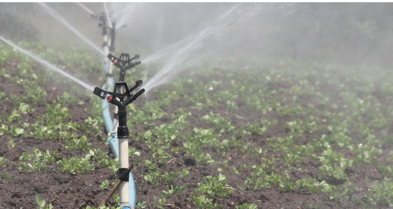
COUNTRYWIDE, AGRICULTURE CONSUMES 62% OF WATER; 22% GOES TO INDUSTRY.

Current usage is unsustainable. Countrywide, agriculture consumes 62% of water, power/industry 22%, humans 14% and other use 2% (e.g. replenishment of lakes). The 12 provinces listed above represent 38% of China's agriculture, 50% of its power generation, 46% of its industry and 41% of its population (CSY 2017). Groundwater levels are falling fast: in 2015 over 230,000 square kilometres (sq. km), about 4% of China's land was suffering from overexploitation; the exploitation rate of the three main northern rivers the Hai, Yellow and Liao in 2015 were 106%, 83% and 76% compared to the world recognised security limit of 40%. The outflow of the Yellow River, China's lifeline in the north, is 10% of what it was in the 1940s and in most years large stretches are dry. Groundwater levels are falling fast in the north, by 1-3 metres a year. One of the effects of overuse is that aquifers collapse, which reduces the capacity to refill when rains are good.