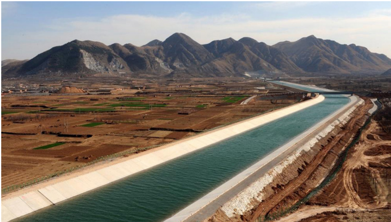
SOME LOCAL INDUSTRIAL ACTIVITY HAS BEEN BANNED TO ENSURE WATER QUALITY FOR THE DANJANKOU RESERVOIR

hydro, solar and wind power generation (discount nuclear: it uses nearly as much water as coal). But those sources will not be able to meet the heavy demands of desalination, both because there is not the space to place them in the east where they are needed; because military and other interests such as shipping and fishing hamper the development of offshore wind farms; and because developing high voltage transmission technology in order to bring electricity from the west will not happen in time (even assuming that the central government can sort out the protectionism of provinces and the grid).