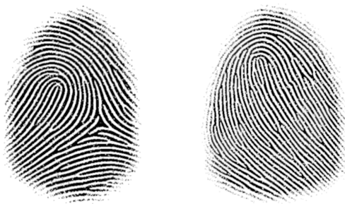
Figure 2 - Synthetic Fingerprints for Test Cards

The minutiae records for Cardholder Fingerprints data objects were created from synthetic fingerprints, which were generated using the Synthetic Fingerprint Generator (SFinGe) from the Biometric System Laboratory at the University of Bologna. 1 The fingerprint on the left in Figure 2 was used as the left index finger, and the fingerprint on the right was used as the right index finger. The image for the right index finger was used in minutiae records for every card except Test PIV Card 2, and the image for the left index finger was used in minutiae records for every card except Test PIV Cards 2 and 7. Test PIV Card 2 represents a card holder from whom no fingerprint data could be collected, and Test PIV Card 7 represents a card holder from whom fingerprint data could only be collected from one finger.