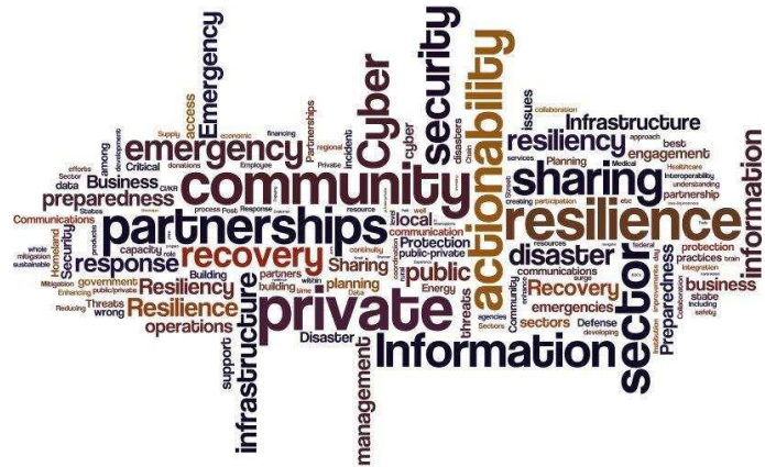
New Orleans, LA, December 10, 2015 - This word cloud represents key words and themes from all of the participants at the 2015 Public-Private Partnerships Conference.