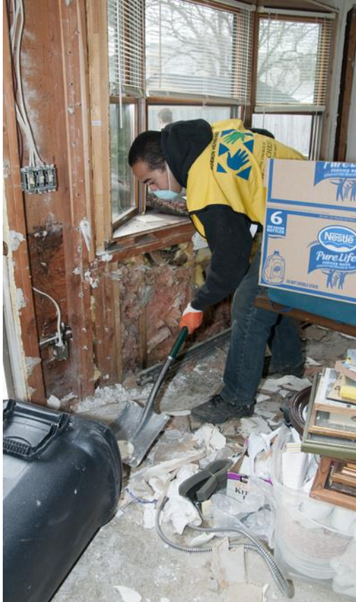
Seaside Heights, NJ, November 24, 2012 – A member of the Mormon Disaster Relief effort clears drywall from a home in Seaside Heights, N.J. that was damaged when Hurricane Sandy came ashore. Volunteer organizations like the Mormon Church and other faith-based programs provided free assistance to survivors in the affected area.

Other government offices may have existing networks with faith-based and community organizations throughout the community. Emergency managers should collaborate with these government offices to reach the broad set of organizations discussed above.