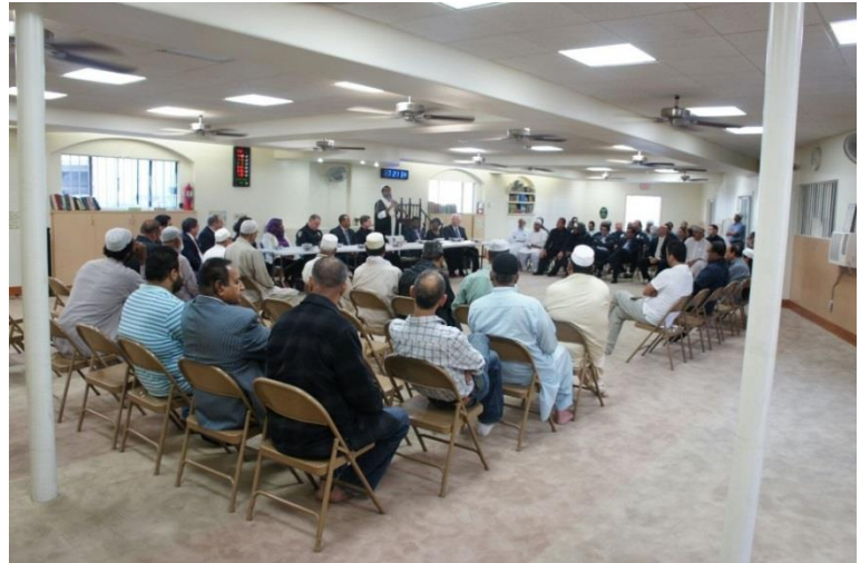
Inglewood, CA, July, 2014 – The DHS Center partners with the Council on Pakistani American Affairs, City of Los Angeles and Los Angeles County Office, and University of Southern California Center for Religion and Civic Culture (CRCC) to engage imams and leaders within the Islamic faith in disaster preparedness during Ramadan.

Reach out to them. Unengaged groups may not understand the language, resources, and infrastructure of emergency management. Consider scheduling time with the organizations to meet with their leaders personally and to explain these concepts as needed. Emergency managers can also assign a staff member to attend one of the organizations' regular meetings to begin building relationships with constituents.