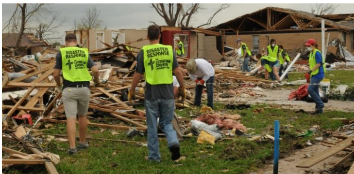
Moore, OK, May 26, 2013 – Volunteers with the Missouri Lutheran Church Disaster Response team help survivors clean up after a deadly tornado. Volunteers provided much needed personal services and were important FEMA partners in disaster recovery.

In contrast, respondents noted that sharing engagement responsibilities among multiple organizations, including emergency management agencies, results in expansive, cross-sector partnerships. The DHS Center tested this approach through the creation of a seven-step engagement process.