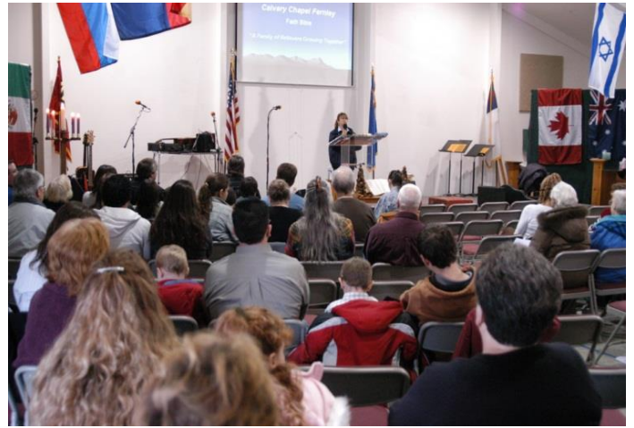
Fernley, NV, January 13, 2008 – A FEMA Disaster Survivor Assistance Team (DSAT) member tells the Calvary Chapel congregation about available FEMA services for residents affected by flooding. DSAT workers contact groups to explain FEMA programs and assistance.

By incorporating these sustainability tips focused on long-term and continuous partner engagement, emergency managers can effectively build resilience across diverse communities.