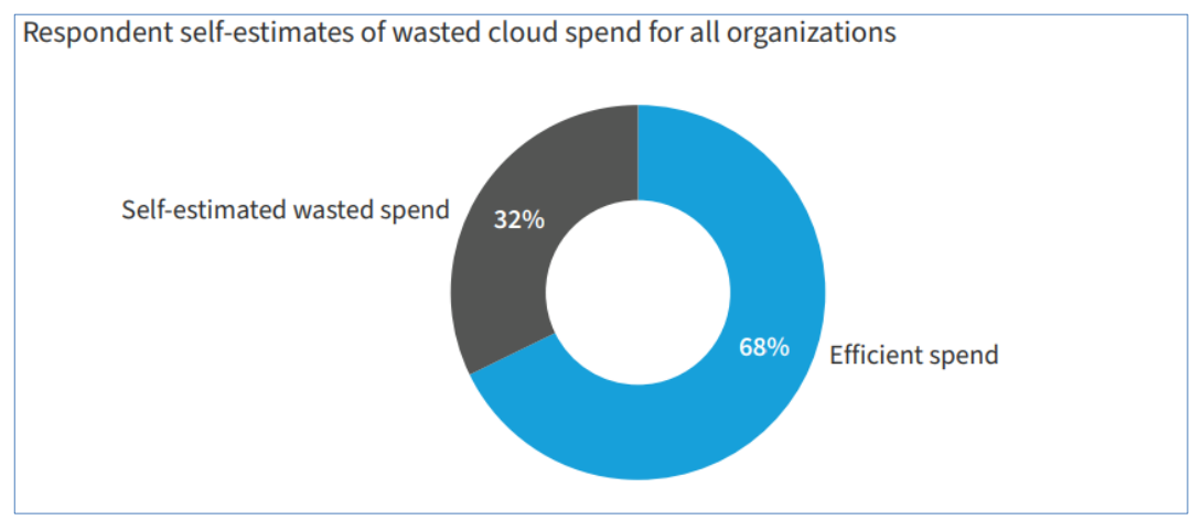
Figure 1 - Source: Flexera 2022 State of the Cloud Report - by Flexera is licensed under CC BY 4.0

As reported by Flexera, respondents reported that almost a third of their cloud services spend was wasted and unproductive. Through careful planning, consistent observation, operational alignment, and prompt action, companies can better ensure the productive use of cloud resources.