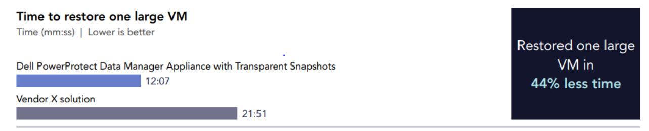
Figure 4: Time required for each solution to restore a single 530GB VM to a Dell PowerStore array.

The whole point of a backup appliance is to recover and restore your data copies quickly (and reliably) after a data integrity, security or outage event. Here, once again the Dell PowerProtect Data Manager Appliance with Transparent Snapshots was much faster according to Principled Technologies' test results below.