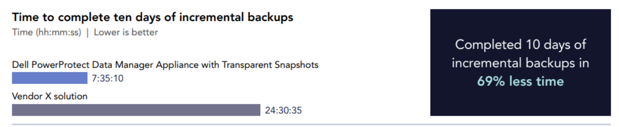
Figure 3: Time required for both solutions to complete 10 days of incremental backups on 500 VMs of various sizes. Lower is better.