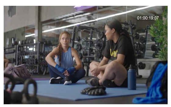
Figure 2. Still photo from PSA shoot

The first highlights an experience of women Veterans. In addition to showing how Veterans can lean on one another, the video also promotes the resources available at REACH. Women Veterans are the fastest-growing Veteran group. Like their peers, women Veterans may struggle across a range of challenges in their civilian life. This video demonstrates how it isn't always easy to ask for help... and how reaching out can make a difference.