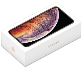
U.S. retail packaging of iPhone Xs Max contains 55 percent recycled content.