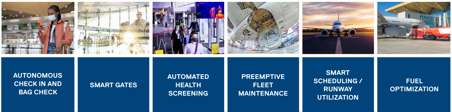
Figure 3. Aviation use case for computer vision—generating insights across air travel