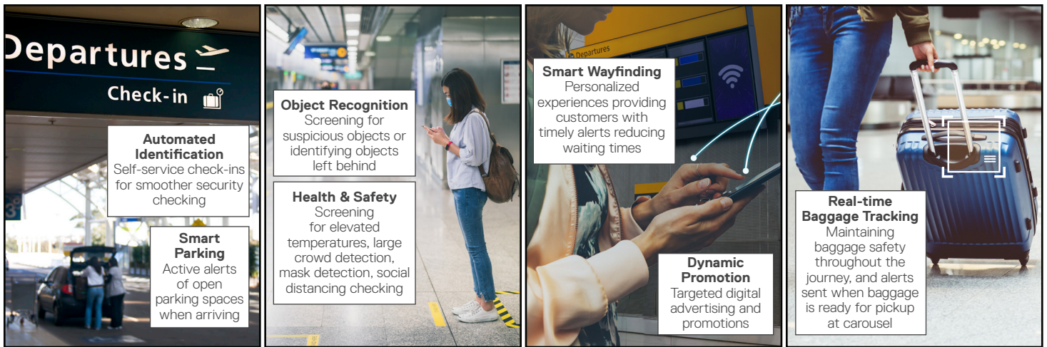
Figure 1: A modern computer vision environment for streamlining and enhancing the passenger experience

Dell Technologies Validated Designs for Computer Vision | Smart Airports is designed to ingest video and edge data once and apply to multiple applications to develop actionable insights and maximize revenue.