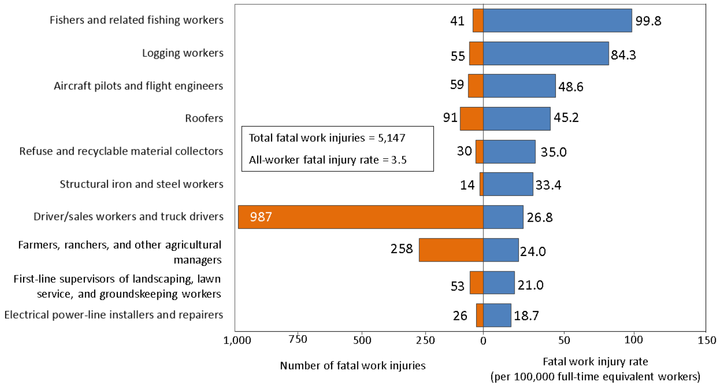
Chart 3. Civilian occupations with high fatal work injury rates, 2017