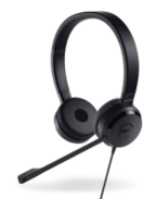
DELL PRO STEREO HEADSET - UC350

Custom dust filters safeguard internal components in factory, warehouse, or retail environments.