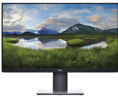
DELL 24 MONITOR - P2419H

23.8" ultrathin bezel optimized for dual display productivity. Easy Arrange feature enables multitasking efficiency and its small base frees valuable workspace.