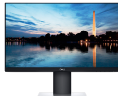
DELL 22 MONITOR - P2219H

23.8" ultrathin bezel optimized for dual display productivity. Easy Arrange feature enables multitasking efficiency and its small base frees valuable workspace.