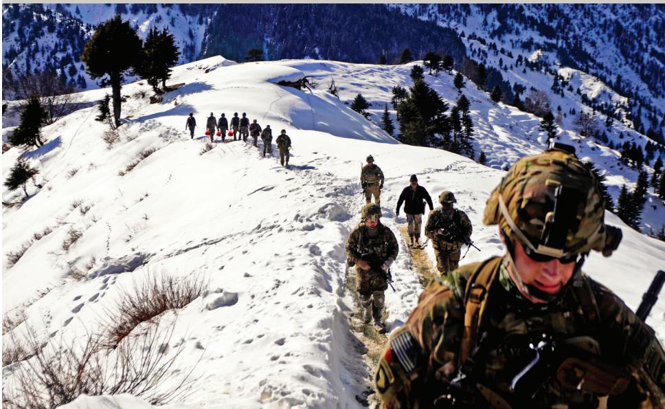
U.S. soldiers and Afghan border police hike along the Afghanistan-Pakistan border in early 2013.