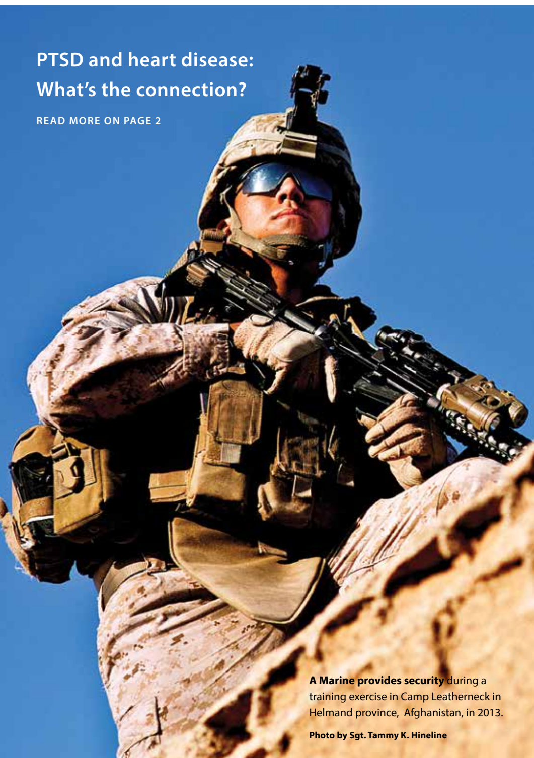
A Marine provides security during a training exercise in Camp Leatherneck in Helmand province, Afghanistan, in 2013.