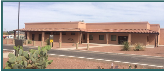
The new SAVAHCS brain bank facility

dispersed throughout the SAVAHCS campus. The new building will be the subject of a VA Central Office site visit in September 2017. We are looking forward to showcasing the facilities and gain greater attention to our important work in the VA system. The Tucson brain bank started in 2008. The operation has increased in size and sophistication since then. Our inventory is growing, our methods for handling the tissue are always improving, and our data collection practices are expanding. More than enhancing our research function, the new facility serves as a benchmark to the brain bank's maturation in its capacity and expertise. This will ultimately have a positive impact on future donations as the bank develops in esteem.