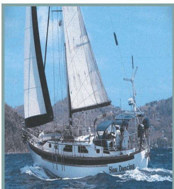
"Slow Dancing" at sea.

We expect to contribute "control tissue", because neither of us has symptoms or a family history of amyotrophic lateral sclerosis (ALS). Control tissue is critically important because it helps researchers understand the causes of brain disorders by contrast to diseased brain tissue. Having our advance directives and registration with VABBB completed will remind