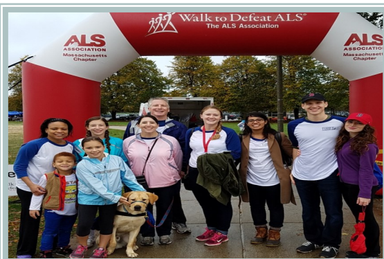
Bottom Left: Members of the VABBB and their families at the finish line