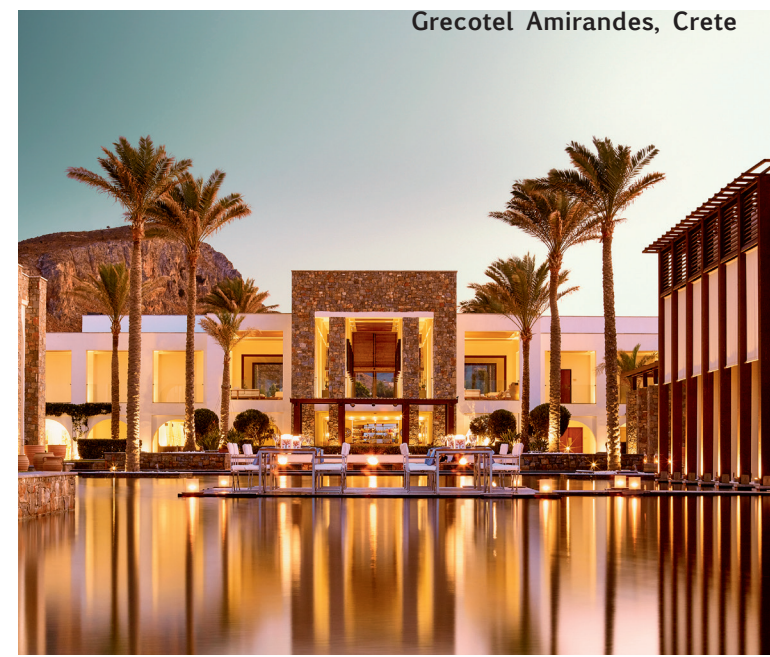
Grecotel Amirandes, Crete

During the two difficult years of the pandemic, the company dynamically stepped forward and kept alive the smile on the