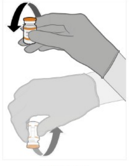
Gently × 10