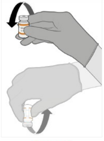
Gently × 10