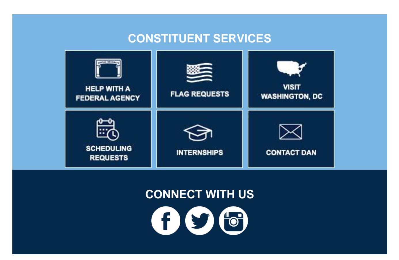
Dan Bishop Member of Congress