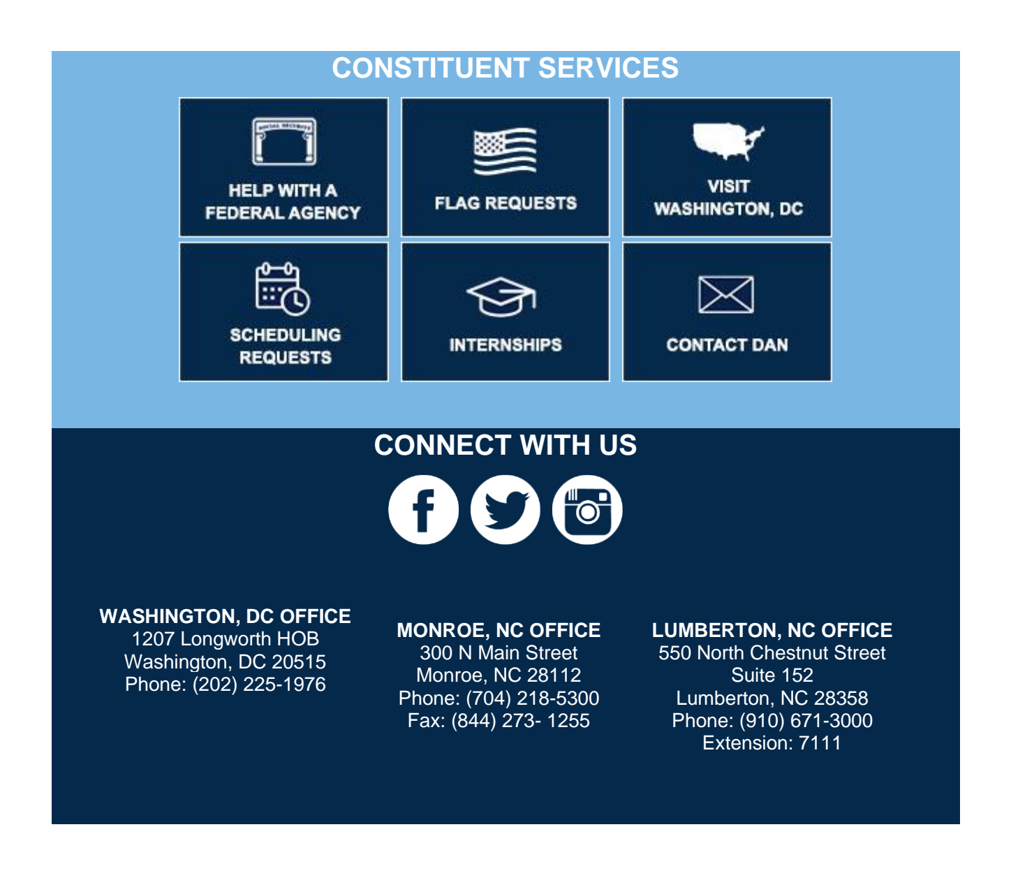
Dan Bishop Member of Congress