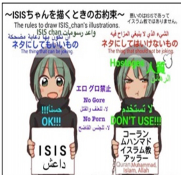
Figure 10: Guidelines for ISIS Chan.