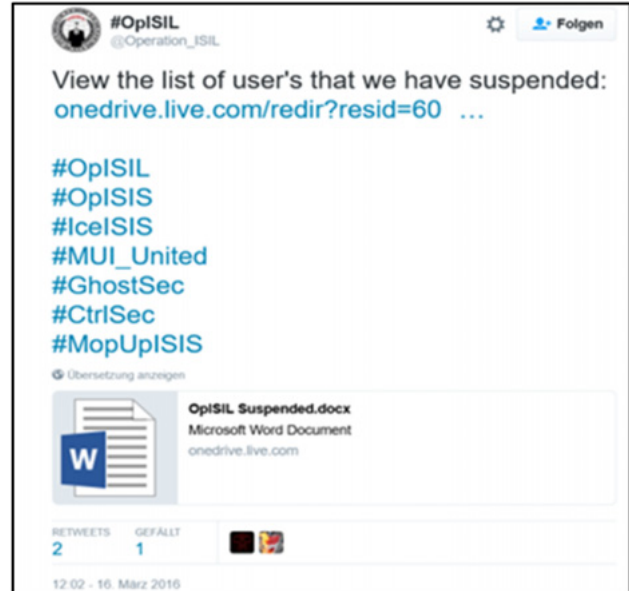
Figure 14: Tweet from @Operation_ISIL.

have been disarmed. Figure 15 illustrates that there is a possibility for everyone to join the war against extremist groups. For this, all users are asked under appropriate instructions to report conspicuous accounts. Other activities are kept hidden from the social network since it involves illegal activities, which are not intended for the public. The success of these hacker attacks remains questionably as numerous sites are callable despite many barriers. Hackers can also be ‘haunted’ by ISIS users. They fight among each other and simultaneously call for a hunt. In the post from 18 th March 2016, @intel_ghost draws attention to a