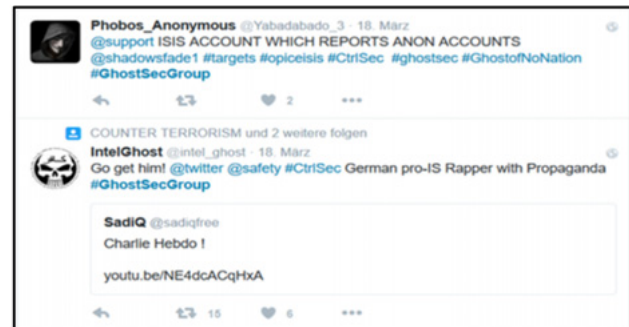
Figure 15: Tweets about #GhostSecGroup.

German ‘pro-IS’ rapper and asks the community to “Go get him!”. The hacker scene participates actively in parodist pictures and videos and distributes them. Hacking, therefore, refers to illegal activities, like the blocking of accounts and the appeal to the population to report suspected persons as well as legal activities by multiplying parodist media.