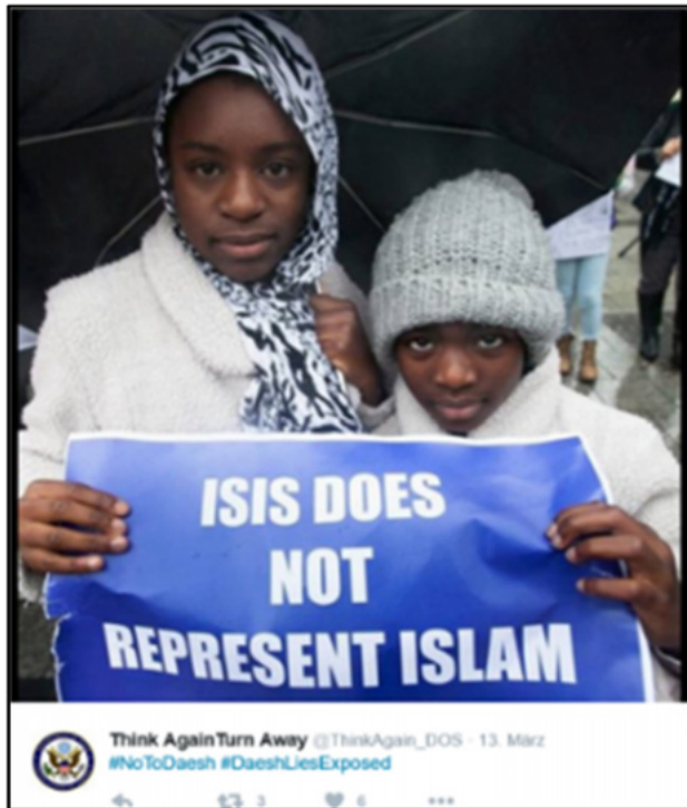
Figure 4: Picture campaign by @ThinkAgain_DOS.

ture remains uncommented; it was only equipped with the hashtags #NoToDaesh and #DaeshLiesExposed. The two women stand symbolically for all modern Muslim women who do not support the ISIS and who do not let themselves be discriminated.