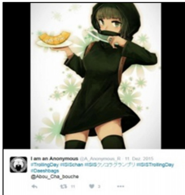
Figure 11: ISIS Chan with a melon.

should fill the results of the image search on “ISIS” with presentations of the anime girl. In the first 24 hours, the hashtags were used 9.000 times on Twitter (ibid.). Figure 11 shows ISIS Chan with a melon on a plate. She holds the knife wrongly at her throat. The subscriber explained that she wanted to teach the ISIS what knives are actually for: cutting melons. 1