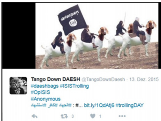
Figure 7: #TrollingDay IS fighters with goats.