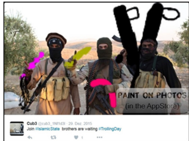
Figure 8: #TrollingDay IS fighters with dildos.