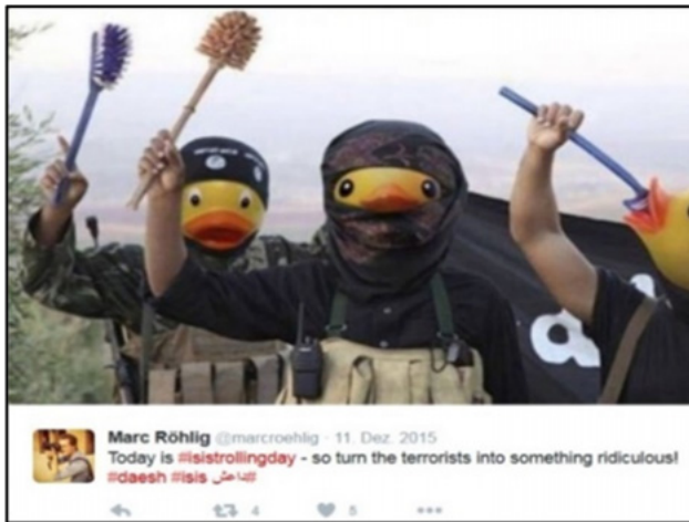
Figure 6: #TrollingDay IS fighters as bath ducks.