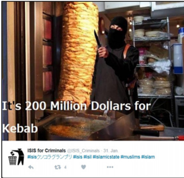
Figure 12: #ISISCrappyCollageGrandPrix IS fighter with kebab.