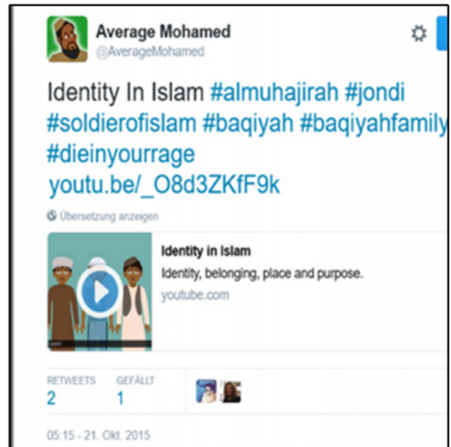
Figure 5: Tweet by @AverageMohamed.

Parody is a hilarious satirical imitation by distortion and exaggeration. The satire is a genre, which criticizes and