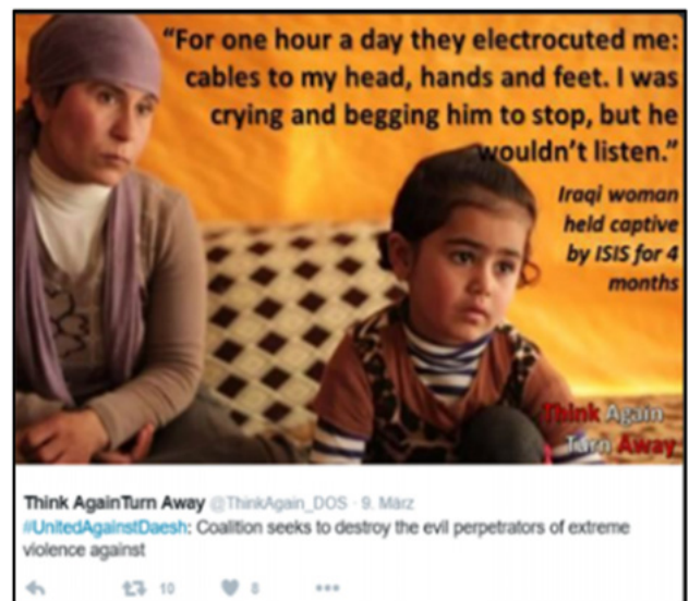
Figure 3: Picture campaign by @ThinkAgain_DOS.

aim is to strengthen the accusations against the ISIS to be violent and ruthless.