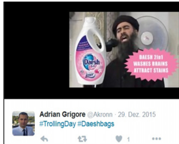
Figure 9: #TrollingDay Abu Bakr al-Baghdadi with detergents.

der penalty of death. In December 2015, a video was released which showed how two homosexual men were captivated and thrown off a roof. ISIS is virtually hunting homosexuals, even more abusive is the description ‘gay’ for them. In Figure 8, one can see armed IS fighters, whose weapons are turned into oversized dildos. The user tweets below: “Join #IslamicState brothers are waiting #TrollingDay.” This implicates that the ISIS were a ‘gay club’, which hurts their dignity. In further pictures IS fighters are shown in lady’s underwear swinging the ‘Gay Pride’-Rainbow-Banner. Also, the hint on the virgins was picked up again by a Meme which tells: “Promise 72 Virgins. Doesn’t mention Gender.”