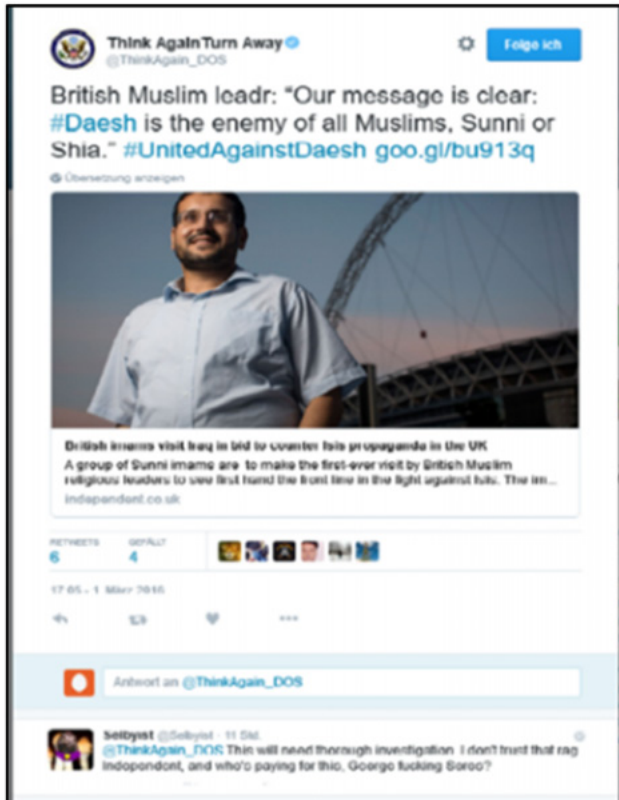
Figure 1: Tweet from @ThinkAgain_DOS.

bodies, which is decorated with the logo of the Syrian-Arabic army and a link to a newspaper article (Figure 2): “Here are the Rebels that were ambushed trying to escape Krak des Chevaliers into Lebanon” (20.03.2014). The comment from @syrmukhabarat assigns the dead to the rebel groups. The news paper article headlines: “11 rebels killed fleeing famed Crusader fort: Syria army” (20.03.2014). Therefore, it connects the two even though the source of the picture is not clear. @ThinkAgain_DOS comments: “[...] They could also be #alquaeda fighters whom #Assad used to send to Iraq and Lebanon #thinkagainturn-away” (20.03.2014). Thereby, the discussion on the unclear source of the picture has been opened and following speculations have been made.