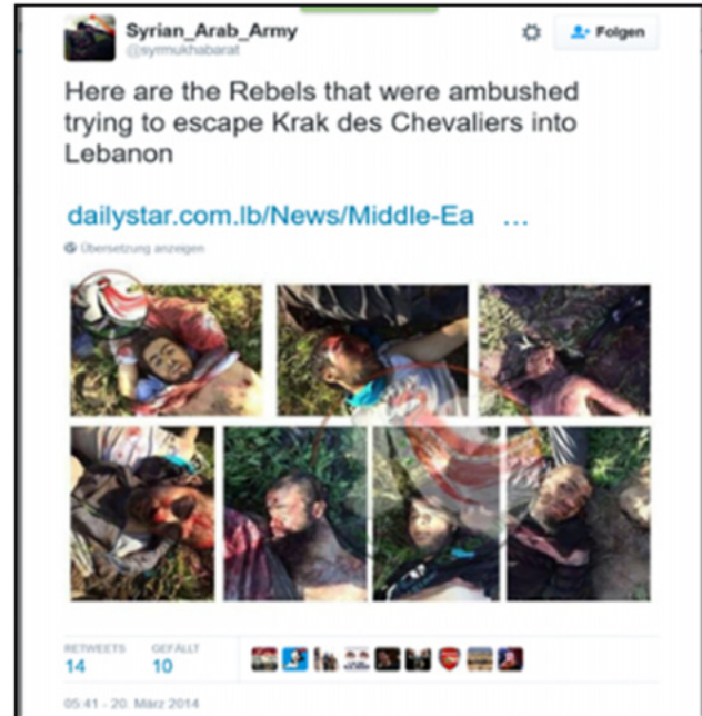
Figure 2: Tweet from @syrmukhabarat.

Besides the news articles, @ThinkAgain_DOS also posts pictures or videos, which are supposed to communicate educational messages. Under #UnitedAgainstDaesh a picture (Figure 3, 09.03.2016) was posted, which shows an Iraqi woman and a girl, who sit on a couch side by side and look seriously: “For one hour a day they electrocuted me: cables to my head, hands and feet. I was crying and begging him to stop, but he wouldn’t listen.” Iraqi woman held captive by ISIS for 4 months.” The comment on the picture says: “#UnitedAgainstDaesh: Coalition seeks to destroy the evil perpetrators of extreme violence against”. The post’s