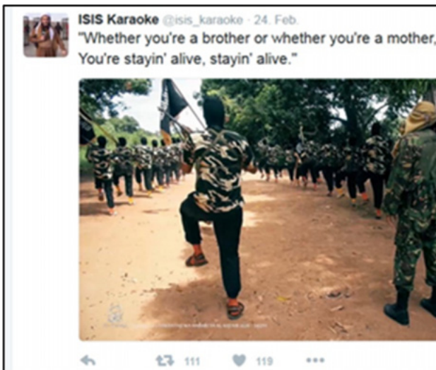
Figure 13: @isis_karaoke IS fighters dance presumably with “Stayin’ alive”.

have been disarmed. Figure 15 illustrates that there is a possibility for everyone to join the war against extremist groups. For this, all users are asked under appropriate instructions to report conspicuous accounts. Other activities are kept hidden from the social network since it involves illegal activities, which are not intended for the public. The success of these hacker attacks remains questionably as numerous sites are callable despite many barriers. Hackers can also be ‘haunted’ by ISIS users. They fight among each other and simultaneously call for a hunt. In the post from 18 th March 2016, @intel_ghost draws attention to a