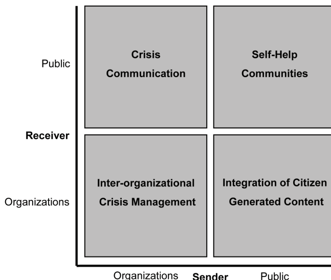
Figure 2. Classification matrix for social software use in crisis management