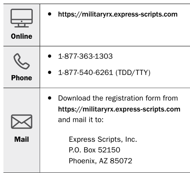
Figure 2.1 TRICARE Pharmacy Home Delivery Registration Methods

Call Express Scripts to lower your out-of-pocket costs by transferring your current maintenance medication prescriptions to TRICARE Pharmacy Home Delivery. You may also contact Express Scripts to convert your current military pharmacy prescriptions to home delivery. TRICARE Pharmacy Home Delivery copayments apply.