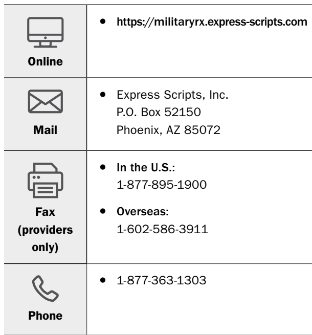
Figure 4.1 Express Scripts Contact Information

Certain specialty medications may only be available through home delivery or retail pharmacies in the specialty network. The specialty network is a select network of retail specialty pharmacies in the TRICARE retail pharmacy network. These pharmacies have expertise in medication management for conditions that require specialty medications, and are able to provide these specialty medications to beneficiaries. Visit https://militaryrx.express-scripts.com/find-pharmacy to find a pharmacy in the specialty network.