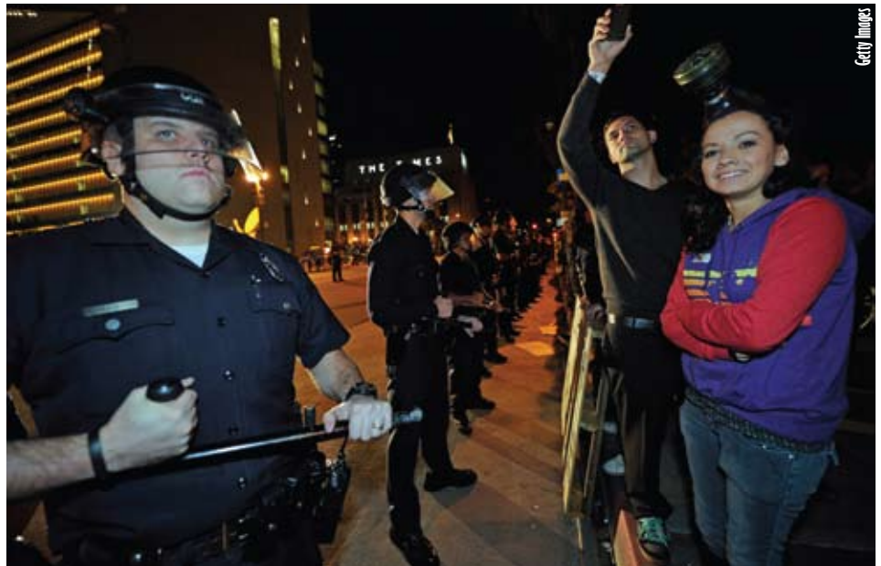
Occupational stress —Studies on police, such as these officers at an “Occupy” protest in Los Angeles, may yield clues on acute stress response and PTSD, say VA researchers.